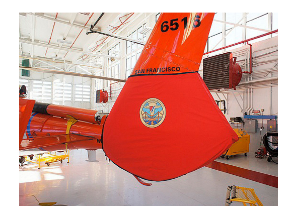
MH-365C Dauphin Tail Fan Fenestron Cover

The Tailboom Cover details vary by model, but generally the helicopter tail boom cover encloses the tail boom from the "bottleneck" to the aft end. They usually also cover the horizontal stabilizers, and are custom made to allow for antennae, lights, and other protrusions. They attach with straps underneath the tail boom. Covers for the vertical and horizontal stabilizers are also available separately. Specific information for each model is available on request.