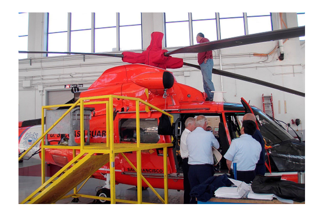
MH-65C Rotor Hub Cover w/ OADS Tube Cover detail

Insulated Covers Material - A special composite material of solution-dyed polyester, 3M Thinsulate insulation, and soft nylon interior fabric. Our insulated covers are designed to complement an engine preheater and help retain heat in the engine compartment after shutdown. If you operate your aircraft in cold-weather, these covers will help prevent engine wear and tear.