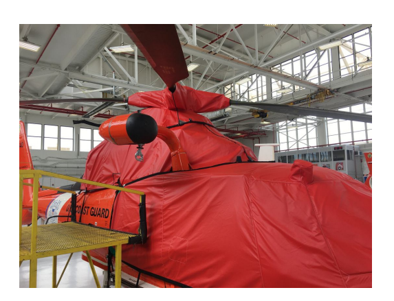
U.S. Coast Guard HH-65 Dolphin Bubble, Engine & Rotor Mast Covers