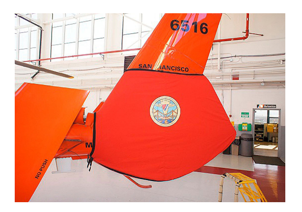
MH-365C Dauphin Tail Fan Fenestron Cover