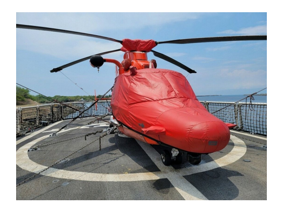
Aerospatiale AS365N2 Bubble, w/Extended Nose/Radome