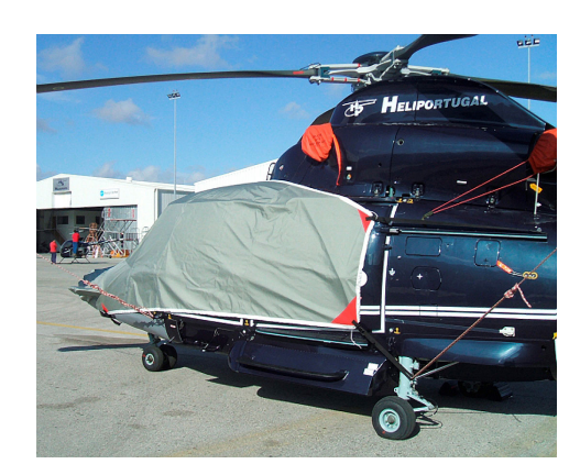
Dauphin Bubble Cover, extended nose

Travel Covers are made with Silver Solution-Dyed Polyester fabric and fully lined over the entire cover. The material is lightweight and more compact for easy stowage in the aircraft. The polyester material is water resistant, but only intended for occasional use outside. We also have an ultra lightweight material available for fitted hangar dust covers. For daily outdoor use, the non-travel Sunbrella Cover is the best choice.