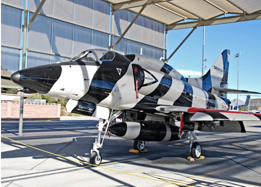
A4 Skyhawk Engine Inlet Plugs

The Engine Inlet Plugs are custom fit for your McDonnell Douglas A-4 Skyhawk, single & tandem intakes, made with heavy-duty vinyl material, and stuffed with a single block of sculpted urethane foam. Each plug has a zipper that allows the foam to be removed and dried if necessary. Engine plugs have 'remove before flight' streamers sewn onto the face of the plugs. Most plugs are imprinted with the aircraft registration number in black for an extra charge. Storage bag NOT included. Engine plugs may be inserted after flight when the engine is still warm. Engine Inlet Plugs are commonly referred to as Cowl Plugs, Intake Plugs, Cowl Blocks, Engine Blocks, and Engine Bunges.