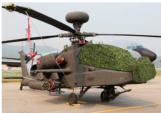
Canopy/Nose Cover, covers canopy glass and TADS