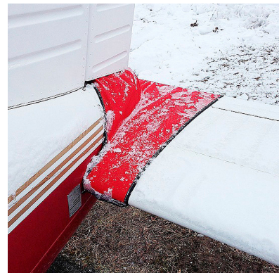
Piper PA-28 Tailcone Cover