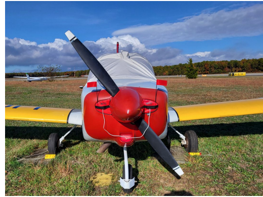
Grumman AA-1A Lynx Engine Inlet Plugs