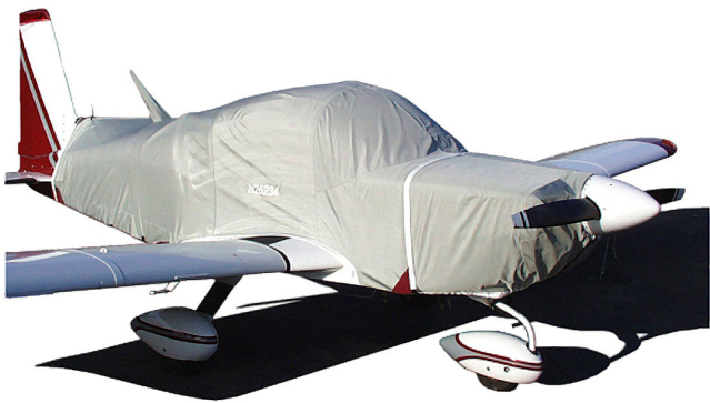
Grumman AA-5 Extended Canopy Cover & Engine Cover

This cover type is made from Silver Acrylic Sunbrella canvas and is 100% lined with a soft and smooth microfiber. Bruce's Custom Covers developed this material combination especially for aircraft protection. The outer material is medium weight and treated for water resistance, UV resistance and anti-static buildup. The inner lining is a very soft and smooth microfiber to prevent scratching. The material is very reflective, and tests show that the cabin interior temperature can be reduced to near-ambient temperature on the hottest of days. It is water, ice and snow repellent, yet breathable to allow moisture to escape from between the cover and the aircraft surface.