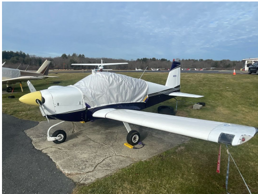
Grumman AA-1A Canopy Cover

This cover type is made from Silver Acrylic Sunbrella canvas and is 100% lined with a soft and smooth microfiber. Bruce's Custom Covers developed this material combination especially for aircraft protection. The outer material is medium weight and treated for water resistance, UV resistance and anti-static buildup. The inner lining is a very soft and smooth microfiber to prevent scratching. The material is very reflective, and tests show that the cabin interior temperature can be reduced to near-ambient temperature on the hottest of days. It is water, ice and snow repellent, yet breathable to allow moisture to escape from between the cover and the aircraft surface.