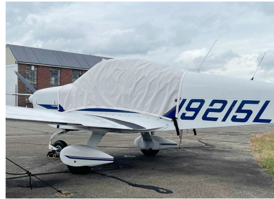
Grumman AA-1A Canopy Cover