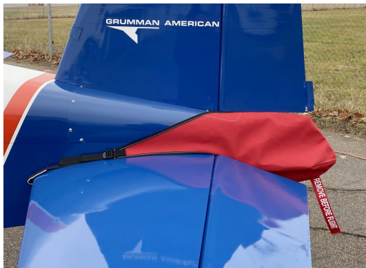
Grumman AA-1 Tailcone Cover

WINTER USE MATERIAL - Made with Solution-Dyed Polyester fabric, this option is intended for seasonal use to aid in deicing, rain mitigation, or for occasional travel. The material is lighter and more compact, but more susceptible to UV damage and may have a shorter useful life if used continuously outside than the all-year use material.