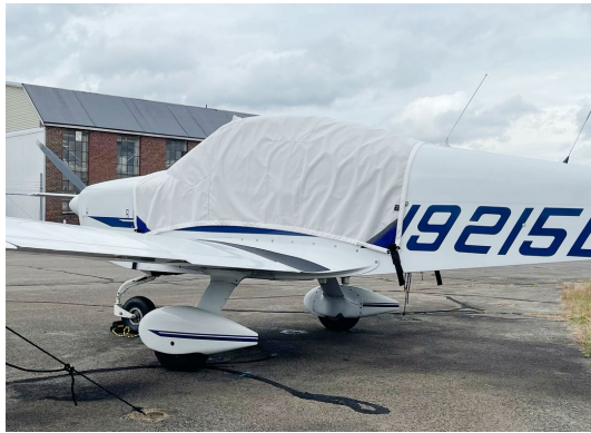
Grumman AA-1 Canopy Cover

This cover type is made from Silver Acrylic Sunbrella canvas and is 100% lined with a soft and smooth microfiber. Bruce's Custom Covers developed this material combination especially for aircraft protection. The outer material is medium weight and treated for water resistance, UV resistance and anti-static buildup. The inner lining is a very soft and smooth microfiber to prevent scratching. The material is very reflective, and tests show that the cabin interior temperature can be reduced to near-ambient temperature on the hottest of days. It is water, ice and snow repellent, yet breathable to allow moisture to escape from between the cover and the aircraft surface.