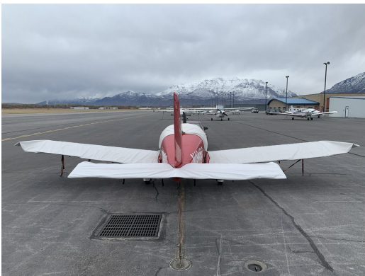
Grumman AA-1 Wing & Horizontal Stabilizer Covers