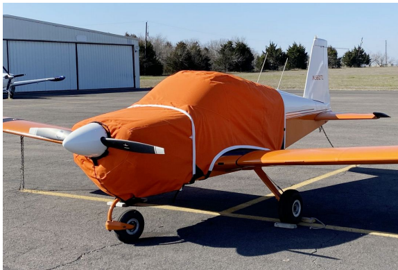
AA-1 Extended Canopy & Fully Enclosed Engine Cover