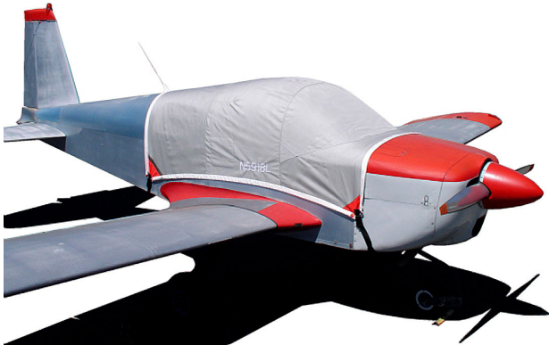
AA1 Standard Canopy Cover