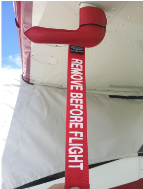
Cessna A185F Pitot Cover