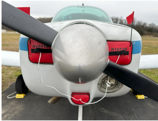
Grumman AA1 Engine Inlet Plugs

and dried if necessary. Engine plugs have warning flags that are visible from the cockpit or 'remove before flight' streamers sewn onto the face of the plugs. Most plugs are imprinted with the aircraft registration number in black for an extra charge. Storage bag NOT included. Engine plugs may be inserted after flight when the engine is still warm. Engine Inlet Plugs are commonly referred to as Cowl Plugs, Intake Plugs, Cowl Blocks, Engine Blocks, and Engine Bungs.