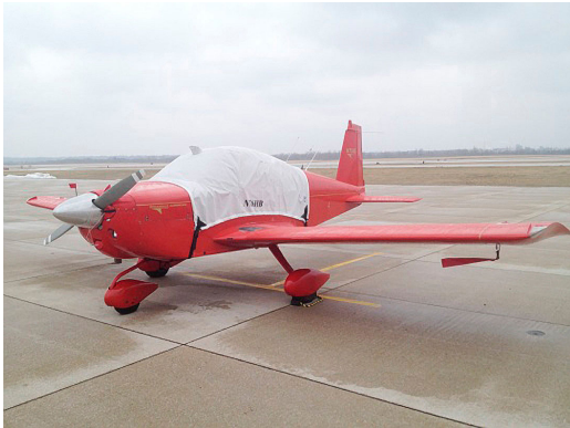
AA1 Canopy Cover, Engine Plugs

and dried if necessary. Engine plugs have warning flags that are visible from the cockpit or 'remove before flight' streamers sewn onto the face of the plugs. Most plugs are imprinted with the aircraft registration number in black for an extra charge. Storage bag NOT included. Engine plugs may be inserted after flight when the engine is still warm. Engine Inlet Plugs are commonly referred to as Cowl Plugs, Intake Plugs, Cowl Blocks, Engine Blocks, and Engine Bungs.