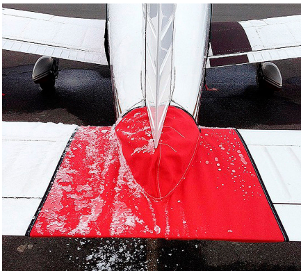
Piper PA-28 Tailcone Cover

WINTER USE MATERIAL - Made with Solution-Dyed Polyester fabric, this option is intended for seasonal use to aid in deicing, rain mitigation, or for occasional travel. The material is lighter and more compact, but more susceptible to UV damage and may have a shorter useful life if used continuously outside than the all-year use material.