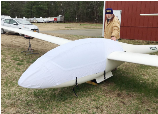
Grob 102 Astir CS Canopy/Nose Cover (test fit)