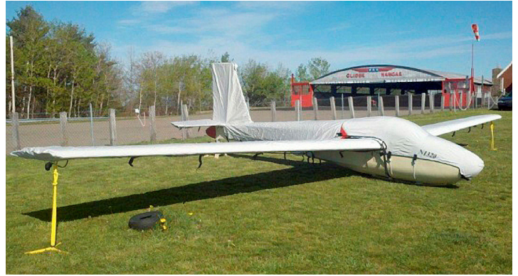
Schweizer 1-26B Canopy/Nose, Empennage & Wing Covers