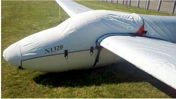
Schweizer SGS 1-26B Canopy/Nose, Wings & Empennage Covers