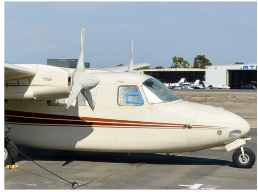
Aero Commander AC500 Ptopellor/Spinner Covers