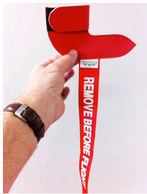
Standard Pitot Cover