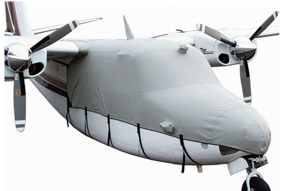
Canopy/Nose Cover (extends over top past leading edge)