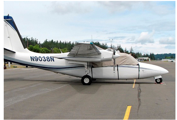
Aero Commander 500 Canopy Cover