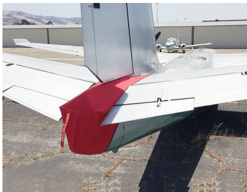
Rockwell Aero Commander Tailcone Cover

The Rockwell Aero Commander 680 Tailcone Cover fits onto the tailcone area to cover the holes that birds can fly into and nest. The cover easily straps onto the leading edge of the horizontal stabilizer with padded hooks or overlaps with the elevators slightly and attaches under the horizontal stabilizers with adjustable straps. Tailcone Covers are normally made with Solution-Dyed Polyester or Acrylic Sunbrella .