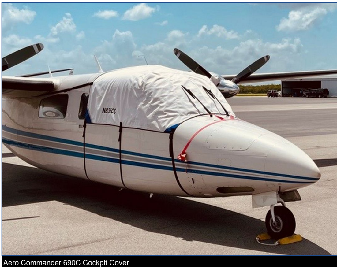
Aero Commander 690C Cockpit Cover