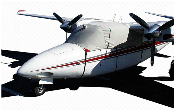
Aero Commander 680 Canopy Cover