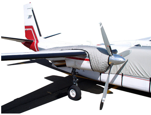
Aero Commander Insulated Engine Cover