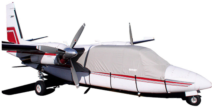
Aero Commander 690b Canopy Cover