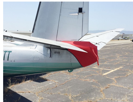
Rockwell Aero Commander Tailcone Cover