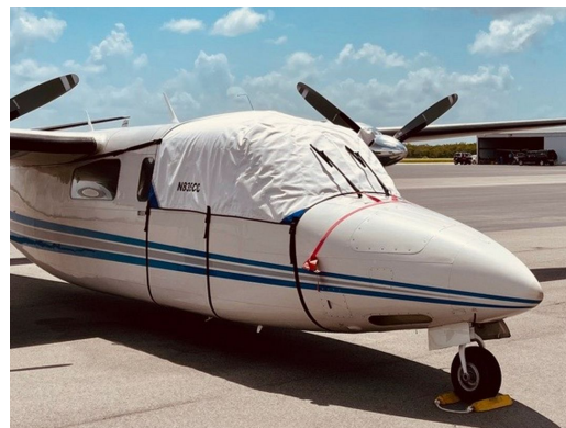
Aero Commander 690C Cockpit Cover