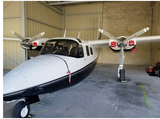
Aero Commander 500-A Pitot Covers