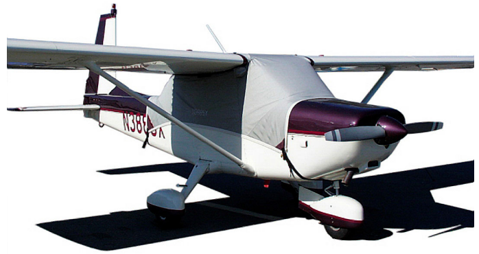
Lark Canopy Cover