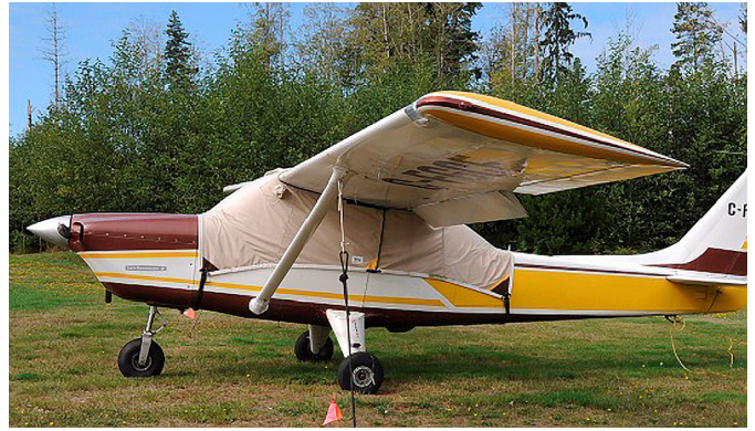
Lark Canopy Cover