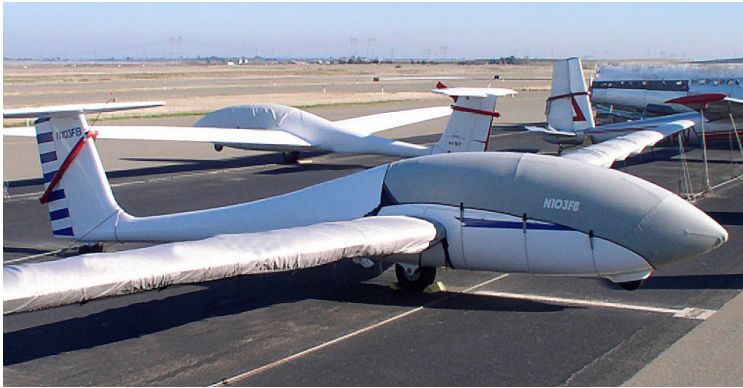
Grob 103 Canopy/Nose Cover and Wing Covers