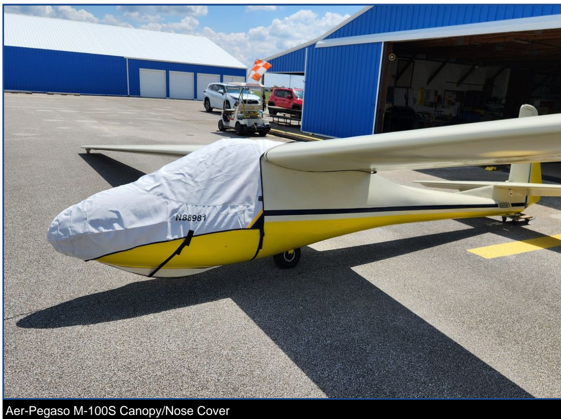
Aer-Pegaso M-100S Canopy/Nose Cover