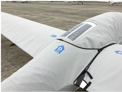
DG-505 Full Cover Set

the hottest of days. It is water, ice and snow repellent, yet breathable to allow moisture to escape from between the cover and the aircraft surface.