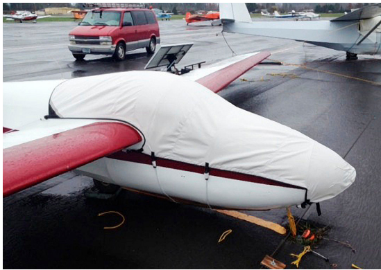
SGS 1-26B Canopy/Nose Cover