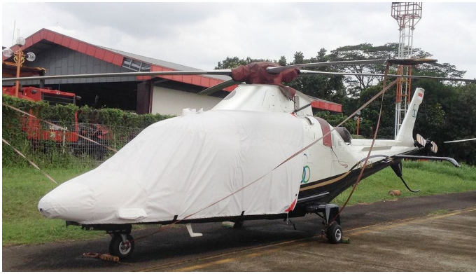
Agusta AW109S/SP Grand, Grand New Bubble Cover