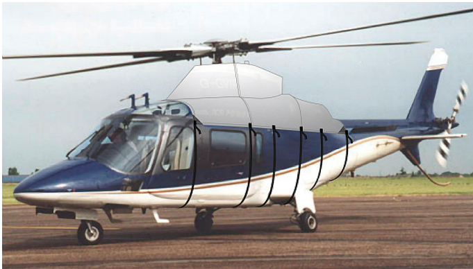
Agusta Power Engine Cover (illustration)