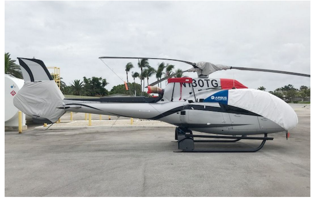
AIRBUS H130 T2, Intake, Exhaust & Tailfan Covers