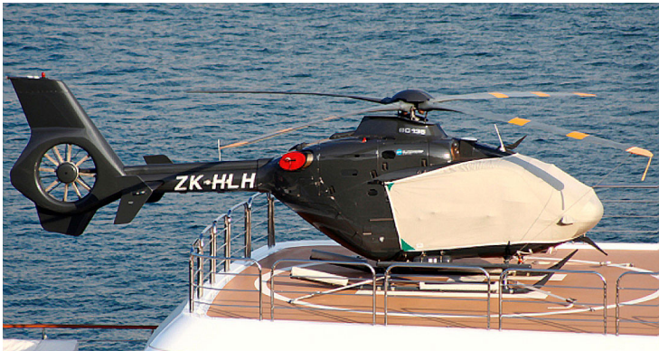
EC-135 Bubble Cover & Exhaust Plugs