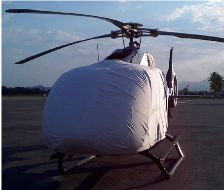
Bubble Cover and Intake/Exhaust Cover

This cover type is made from Silver Acrylic Sunbrella canvas and is 100% lined with a soft and smooth microfiber. Bruce's Custom Covers developed this material combination especially for aircraft protection. The outer material is medium weight and treated for water resistance, UV resistance and anti-static buildup. The inner lining is a very soft and smooth microfiber to prevent scratching. The material is very reflective, and tests show that the cabin interior temperature can be reduced to near-ambient temperature on the hottest of days. It is water, ice and snow repellent, yet breathable to allow moisture to escape from between the cover and the aircraft surface.