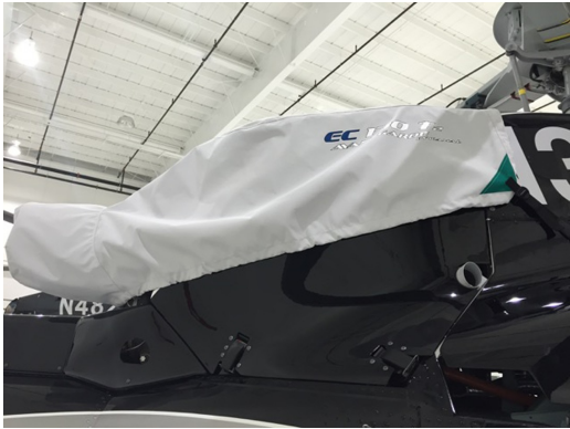
EC-130 Engine Area/Exhaust Cover

cinched tight at the blade root with straps and quick-release plastic buckles. The Cold Weather Blade Covers are fitted with full-length zippers and optional deice “boots” designed to accept a preheater hose; a small opening at the tip of the cover allows for some air circulation and drainage in freezing weather. Some part numbers have features for an extra charge.