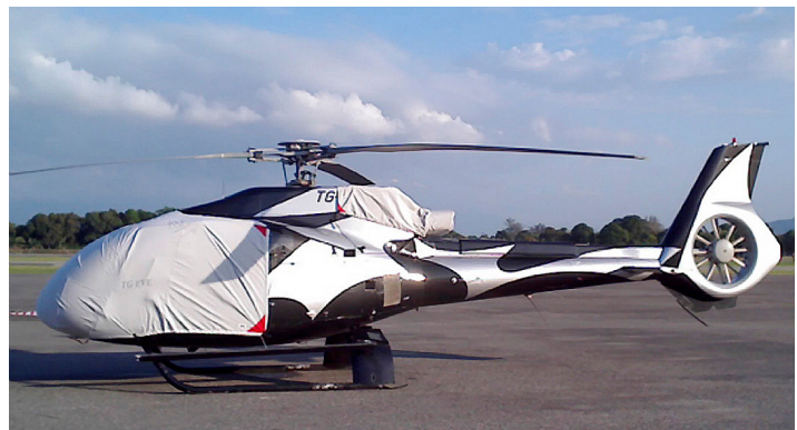
Bubble Cover and Intake/Exhaust Cover