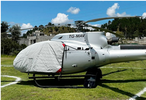
Airbus H-130 Insulated Bubble Cover

This cover type is made from Silver Acrylic Sunbrella canvas and is 100% lined with a soft and smooth microfiber. Bruce's Custom Covers developed this material combination especially for aircraft protection. The outer material is medium weight and treated for water resistance, UV resistance and anti-static buildup. The inner lining is a very soft and smooth microfiber to prevent scratching. The material is very reflective, and tests show that the cabin interior temperature can be reduced to near-ambient temperature on the hottest of days. It is water, ice and snow repellent, yet breathable to allow moisture to escape from between the cover and the aircraft surface.