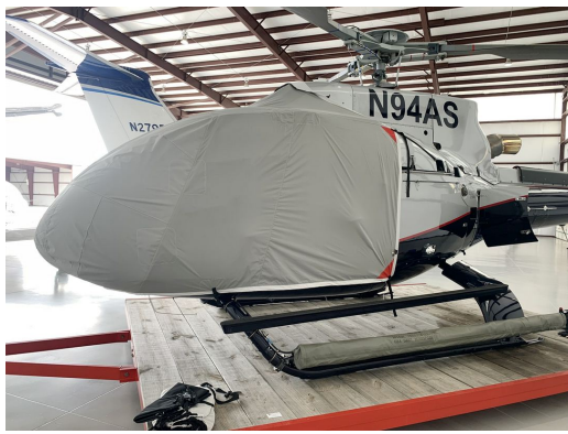
Airbus H-130 Bubble Cover, Travel Weight