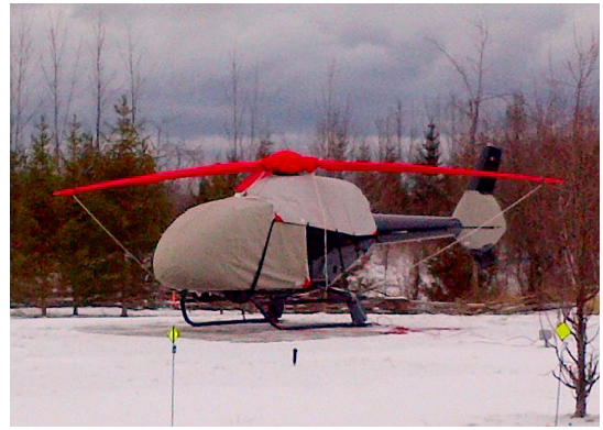
EC-130 Bubble, Engine, Rotor Hub, Blade & Tailfan Covers