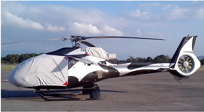
Bubble Cover and Intake/Exhaust Cover