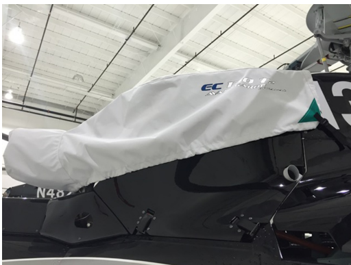
EC-130 Engine Area/Exhaust Cover

The Engine Exhaust Plugs are custom fit for your Airbus Helicopter H-130 exhaust openings, made with heavy-duty vinyl material, and stuffed with a single block of sculpted urethane foam. Exhaust plugs have 'Remove Before Flight' streamers sewn onto the face of the plugs. Exhaust plugs may be inserted soon after flight when the engine is still warm. Engine Inlet Plugs are commonly referred to as Cowl Plugs, Intake Plugs, Cowl Blocks, Engine Blocks, and Engine Bungs.