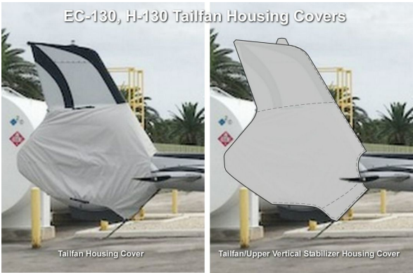
Airbus Helicopter H-130 Tailfan Housing Covers

The Tailboom Cover details vary by model, but generally the helicopter tail boom cover encloses the tail boom from the "bottleneck" to the aft end. They usually also cover the horizontal stabilizers, and are custom made to allow for antennae, lights, and other protrusions. They attach with straps underneath the tail boom. Covers for the vertical and horizontal stabilizers are also available separately. Specific information for each model is available on request.