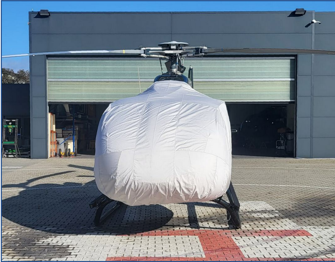
Airbus Helicopter H-130 Bubble Cover, Extends To Cover Fwd Engine Inlet