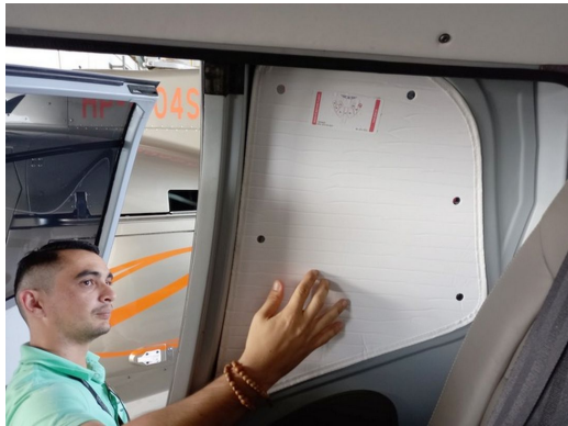
Airbus Helicopter EC130 B4 Side Window Heatshields

Heatshields are interior sunshades for an aircraft's windows or canopy glass. The product is a unique composite of closed-cell foam with a silver mylar finish. The semi-rigid design is stiff enough to stand along the inside of the windshield using sun visors or window framing. It folds up flat and easily stores in the included storage sleeve. Some designs may require velcro and suction cups. A Heatshield is an excellent short-term remedy for cockpit overheating.