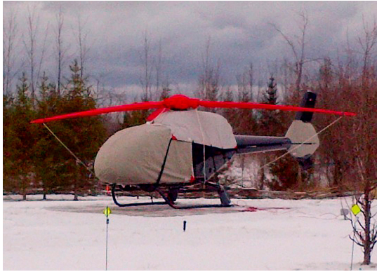
EC-130 Bubble, Engine, Rotor Hub, Blade & Tailfan Covers

some air circulation and drainage in freezing weather. Some part numbers have features for an extra charge.