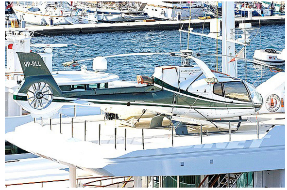
EC-130 Front, Side and Skylight Window HeatShields