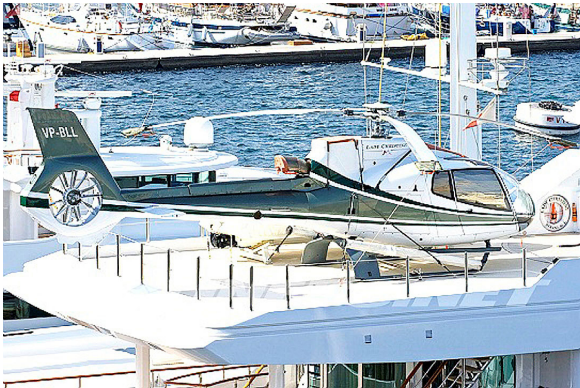
EC-130 Front, Side and Skylight Window HeatShields