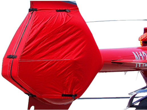
Eurocopter EC-120 Tailfan Cover

The Tailboom Cover details vary by model, but generally the helicopter tail boom cover encloses the tail boom from the "bottleneck" to the aft end. They usually also cover the horizontal stabilizers, and are custom made to allow for antennae, lights, and other protrusions. They attach with straps underneath the tail boom. Covers for the vertical and horizontal stabilizers are also available separately. Specific information for each model is available on request.