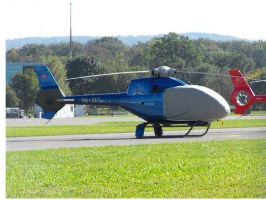
EC-130 Bubble, Tailfan, and Rotor Hub Cover