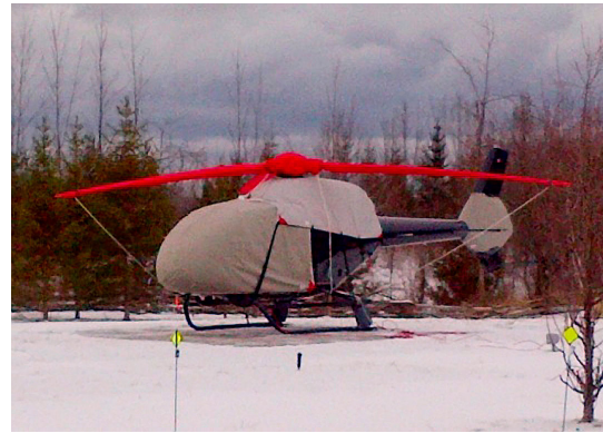
EC-130 Bubble, Engine, Rotor Hub, Blade & Tailfan Covers