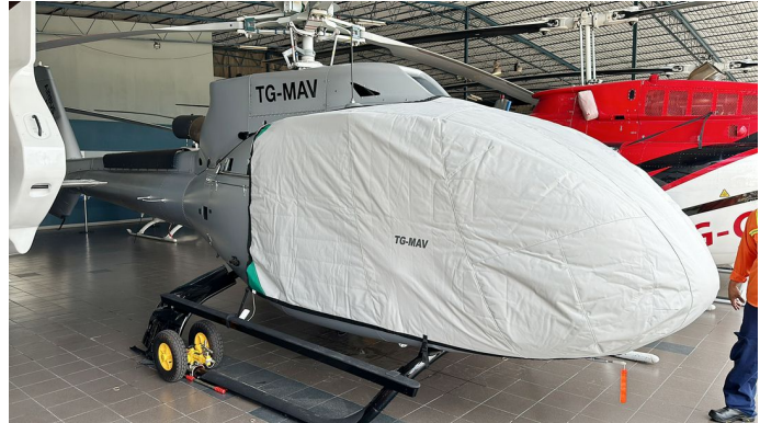
Airbus H-130 Insulated Bubble Cover