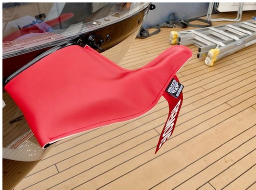
Airbus Helicopter H145 Pitot Tube Cover

The Engine Inlet Plugs are custom fit for your Airbus Helicopter EC-145, UH-145, BK-117 D-2 intakes, made with heavy-duty vinyl material, and stuffed with a single block of sculpted urethane foam. Each plug has a zipper that allows the foam to be removed and dried if necessary. Engine plugs have 'Remove Before Flight' streamers sewn onto the face of the plugs. Most plugs are imprinted with the aircraft registration number in black for an extra charge. Storage bag NOT included. Engine plugs may be inserted after flight when the engine is still warm. Engine Inlet Plugs are commonly referred to as Cowl Plugs, Intake Plugs, Cowl Blocks, Engine Blocks, and Engine Bungs.