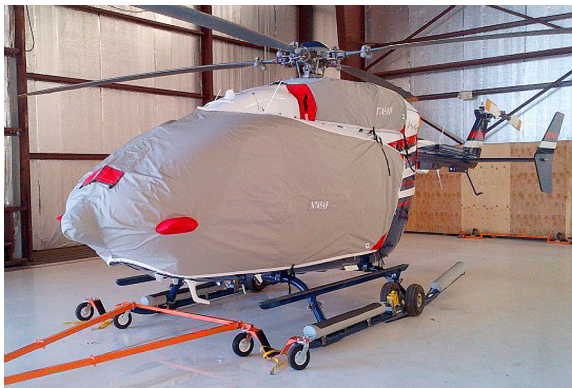
Bubble Cover w/ nose mounted radome & Upper Deck Plugs/Cover

This cover type is made from Silver Acrylic Sunbrella canvas and is 100% lined with a soft and smooth microfiber. Bruce's Custom Covers developed this material combination especially for aircraft protection. The outer material is medium weight and treated for water resistance, UV resistance and anti-static buildup. The inner lining is a very soft and smooth microfiber to prevent scratching. The material is very reflective, and tests show that the cabin interior temperature can be reduced to near-ambient temperature on the hottest of days. It is water, ice and snow repellent, yet breathable to allow moisture to escape from between the cover and the aircraft surface.