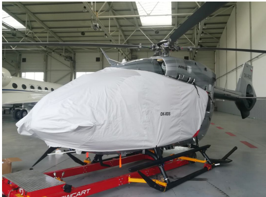
Airbus Helicopter EC-145 Bubble Cover with Radome & Wire Strike

This cover type is made from Silver Acrylic Sunbrella canvas and is 100% lined with a soft and smooth microfiber. Bruce's Custom Covers developed this material combination especially for aircraft protection. The outer material is medium weight and treated for water resistance, UV resistance and anti-static buildup. The inner lining is a very soft and smooth microfiber to prevent scratching. The material is very reflective, and tests show that the cabin interior temperature can be reduced to near-ambient temperature on the hottest of days. It is water, ice and snow repellent, yet breathable to allow moisture to escape from between the cover and the aircraft surface.