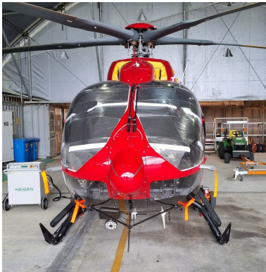
Airbus Helicopter H145D3 Windshield Heatshields, Engine Plugs

The Engine Inlet Plugs are custom fit for your Airbus Helicopter H145, UH-145, BK-117 D-2, D-3 intakes, made with heavy-duty vinyl material, and stuffed with a single block of sculpted urethane foam. Each plug has a zipper that allows the foam to be removed and dried if necessary. Engine plugs have 'Remove Before Flight' streamers sewn onto the face of the plugs. Most plugs are imprinted with the aircraft registration number in black for an extra charge. Storage bag NOT included. Engine plugs may be inserted after flight when the engine is still warm. Engine Inlet Plugs are commonly referred to as Cowl Plugs, Intake Plugs, Cowl Blocks, Engine Blocks, and Engine Bungs.