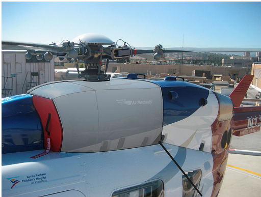
Upper Deck Plugs/Cover

The Engine Inlet Plugs are custom fit for your Airbus Helicopter EC-145, UH-145, BK-117 D-2 intakes, made with heavy-duty vinyl material, and stuffed with a single block of sculpted urethane foam. Each plug has a zipper that allows the foam to be removed and dried if necessary. Engine plugs have 'Remove Before Flight' streamers sewn onto the face of the plugs. Most plugs are imprinted with the aircraft registration number in black for an extra charge. Storage bag NOT included. Engine plugs may be inserted after flight when the engine is still warm. Engine Inlet Plugs are commonly referred to as Cowl Plugs, Intake Plugs, Cowl Blocks, Engine Blocks, and Engine Bungs.