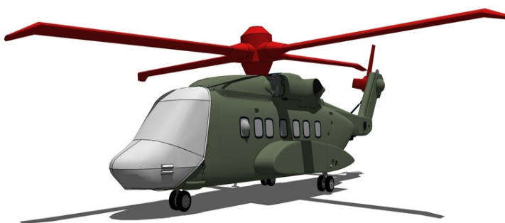
Sikorsky S-92 Windshield/Nose, Blade, Rotor Hub & Tail Rotor Covers