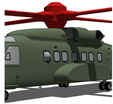
Sikorsky S-92 Main Rotor Hub Cover