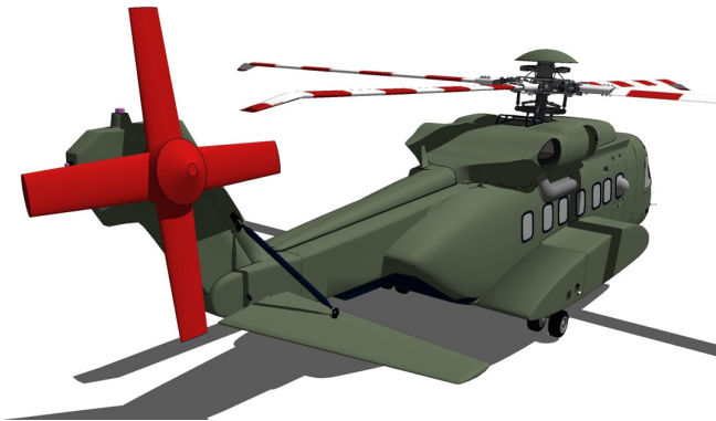
Sikorsky S-92 Tail Rotor Blade and Hub Covers

WINTER USE MATERIAL - Made with Solution-Dyed Polyester fabric, this option is intended for seasonal use to aid in deicing, rain mitigation, or for occasional travel. The material is lighter and more compact, but more susceptible to UV damage and may have a shorter useful life if used continuously outside than the all-year use material.