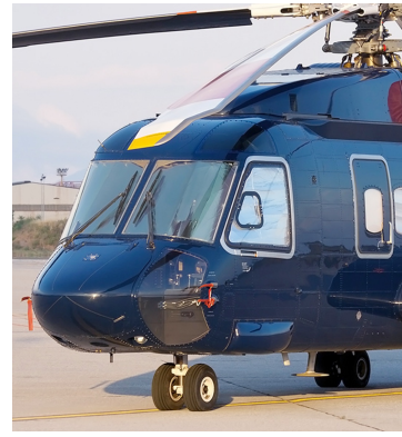
Sikorsky S-92 Cockpit HeatShields