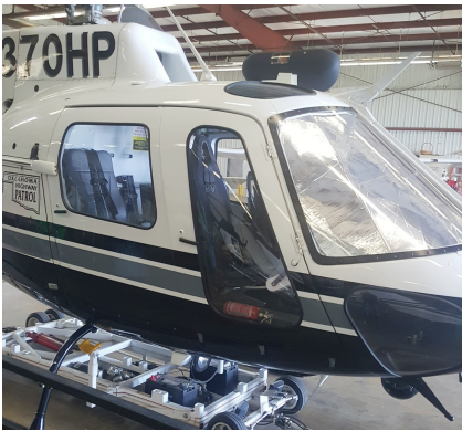
Aerospatiale AS350 Astar, Ecureuil, Esquilo, Fennec Windshield Heatshields

window framing. It folds up flat and easily stores in the included storage sleeve. Some designs may require velcro and suction cups. A Heatshield is an excellent short-term remedy for cockpit overheating.