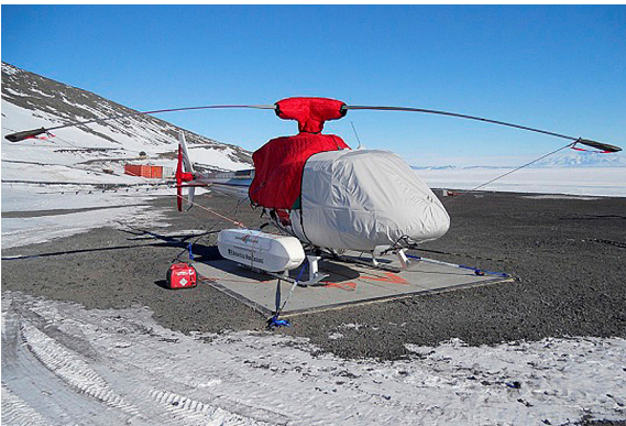
AS350 Bubble Cover w/ Cargo Mirror, Blade Tie-downs, Insulated Engine, Insulated Main Rotor Hub & Insulated Tail Rotor Covers