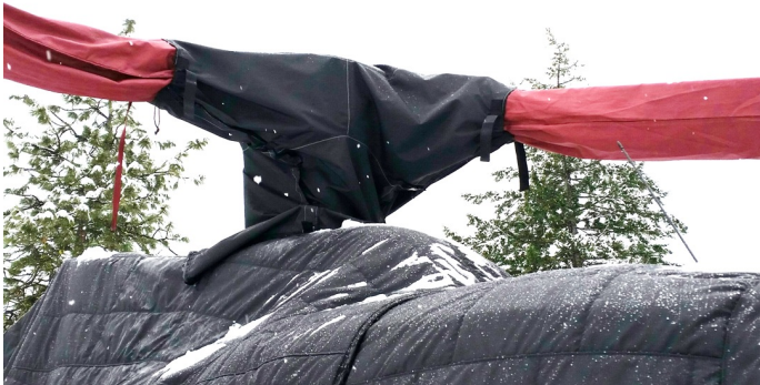
Bubble Cover, Intake/Exhaust, Rotor Mast, Tail Rotor & Main Body Covers