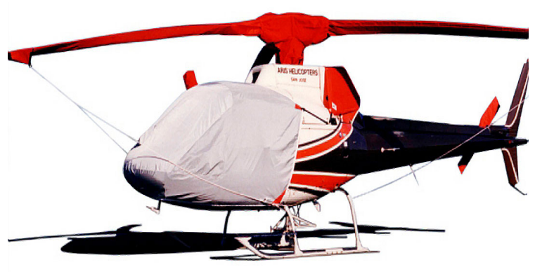
AS350 Bubble Cover w/ Cargo Mirror, Blade Tie-downs, Insulated Engine, Insulated Main Rotor Hub and Insulated Tail Rotor Covers