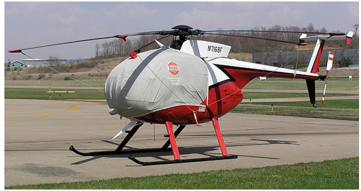
Hughes 500D Bubble Cover with Wire Strike detail and Blade Tie-downs