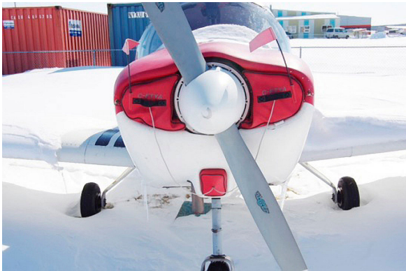
Alarus CH2000 Engine Plugs

Engine Inlet Plugs are custom fit for your Aircraft Mfg. & Development Alarus CH2000 intakes, made with heavy-duty vinyl material, and stuffed with a single block of sculpted urethane foam. Each plug has a zipper that allows the foam to be removed and dried if necessary. Engine plugs have warning flags that are visible from the cockpit or 'remove before flight' streamers sewn onto the face of the plugs. Most plugs are imprinted with the aircraft registration number in black for an extra charge. Storage bag NOT included. Engine plugs may be inserted after flight when the engine is still warm. Engine Inlet Plugs are commonly referred to as Cowl Plugs, Intake Plugs, Cowl Blocks, Engine Blocks, and Engine Bungs.