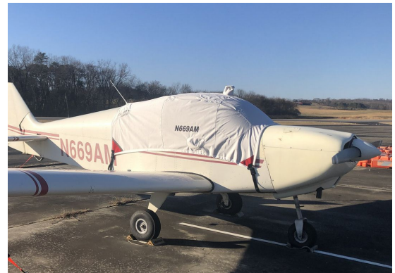
Alarus CH2000 Canopy Cover