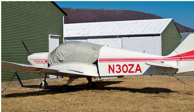
Alarus CH2000 Canopy Cover

This cover type is made from Silver Acrylic Sunbrella canvas and is 100% lined with a soft and smooth microfiber. Bruce's Custom Covers developed this material combination especially for aircraft protection. The outer material is medium weight and treated for water resistance, UV resistance and anti-static buildup. The inner lining is a very soft and smooth microfiber to prevent scratching. The material is very reflective, and tests show that the cabin interior temperature can be reduced to near-ambient temperature on the hottest of days. It is water, ice and snow repellent, yet breathable to allow moisture to escape from between the cover and the aircraft surface.