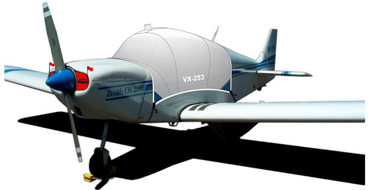
AMD Alarus CH2000 Std Canopy Cover & Engine Plugs (Illustration)