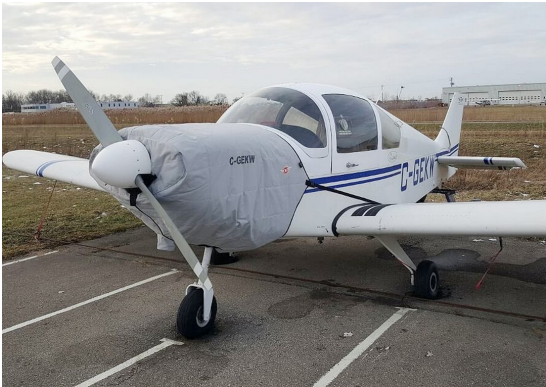
Alarus CH-2000 Insulated Engine Cover