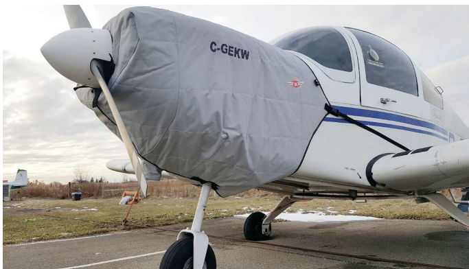
Alarus CH-2000 Insulated Engine Cover

This cover type is made from Silver Acrylic Sunbrella canvas and is 100% lined with a soft and smooth microfiber. Bruce's Custom Covers developed this material combination especially for aircraft protection. The outer material is medium weight and treated for water resistance, UV resistance and anti-static buildup. The inner lining is a very soft and smooth microfiber to prevent scratching. The material is very reflective, and tests show that the cabin interior temperature can be reduced to near-ambient temperature on the hottest of days. It is water, ice and snow repellent, yet breathable to allow moisture to escape from between the cover and the aircraft surface.