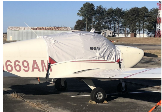
Alarus CH2000 Canopy Cover