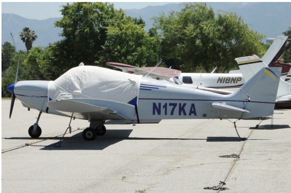
Alarus Canopy Cover

This cover type is made from Silver Acrylic Sunbrella canvas and is 100% lined with a soft and smooth microfiber. Bruce's Custom Covers developed this material combination especially for aircraft protection. The outer material is medium weight and treated for water resistance, UV resistance and anti-static buildup. The inner lining is a very soft and smooth microfiber to prevent scratching. The material is very reflective, and tests show that the cabin interior temperature can be reduced to near-ambient temperature on the hottest of days. It is water, ice and snow repellent, yet breathable to allow moisture to escape from between the cover and the aircraft surface.