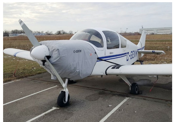
Alarus CH-2000 Insulated Engine Cover