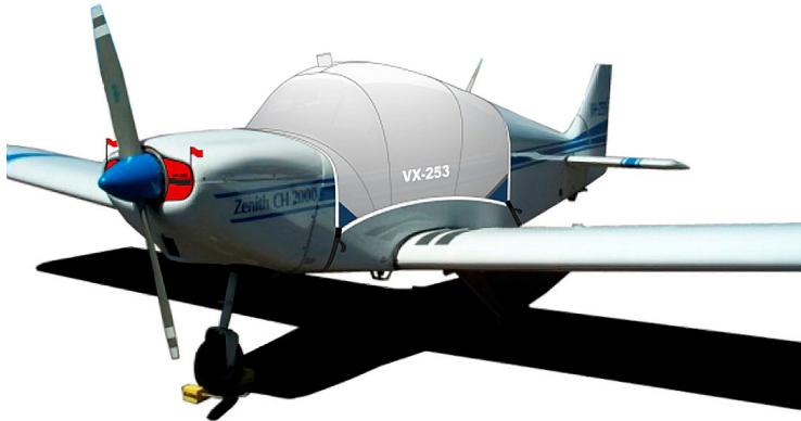
AMD Alarus CH2000 Std Canopy Cover & Engine Plugs (Illustration)

Engine Inlet Plugs are custom fit for your Aircraft Mfg. & Development Alarus CH2000 intakes, made with heavy-duty vinyl material, and stuffed with a single block of sculpted urethane foam. Each plug has a zipper that allows the foam to be removed and dried if necessary. Engine plugs have warning flags that are visible from the cockpit or 'remove before flight' streamers sewn onto the face of the plugs. Most plugs are imprinted with the aircraft registration number in black for an extra charge. Storage bag NOT included. Engine plugs may be inserted after flight when the engine is still warm. Engine Inlet Plugs are commonly referred to as Cowl Plugs, Intake Plugs, Cowl Blocks, Engine Blocks, and Engine Bungs.