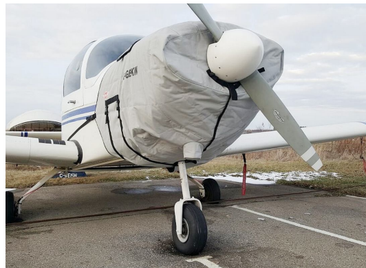
Alarus CH-2000 Insulated Engine Cover