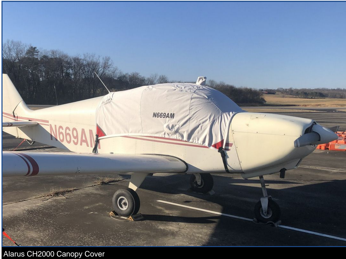
Alarus CH2000 Canopy Cover