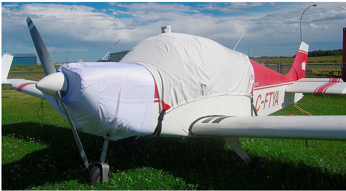
Alarus CH2000 Canopy Cover & Engine Cover (test fit)