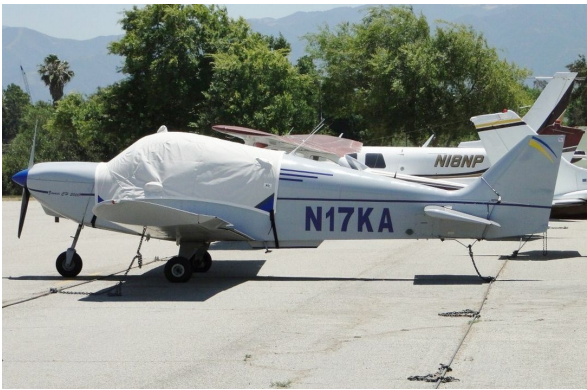
Alarus Canopy Cover

This cover type is made from Silver Acrylic Sunbrella canvas and is 100% lined with a soft and smooth microfiber. Bruce's Custom Covers developed this material combination especially for aircraft protection. The outer material is medium weight and treated for water resistance, UV resistance and anti-static buildup. The inner lining is a very soft and smooth microfiber to prevent scratching. The material is very reflective, and tests show that the cabin interior temperature can be reduced to near-ambient temperature on the hottest of days. It is water, ice and snow repellent, yet breathable to allow moisture to escape from between the cover and the aircraft surface.