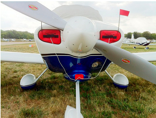
Van's RV-10 Canopy Cover & Engine Inlet Plugs

Engine Inlet Plugs are custom fit for your Direct Fly Alto intakes, made with heavy-duty vinyl material, and stuffed with a single block of sculpted urethane foam. Each plug has a zipper that allows the foam to be removed and dried if necessary. Engine plugs have warning flags that are visible from the cockpit or 'remove before flight' streamers sewn onto the face of the plugs. Most plugs are imprinted with the aircraft registration number in black for an extra charge. Storage bag NOT included. Engine plugs may be inserted after flight when the engine is still warm. Engine Inlet Plugs are commonly referred to as Cowl Plugs, Intake Plugs, Cowl Blocks, Engine Blocks, and Engine Bungs.