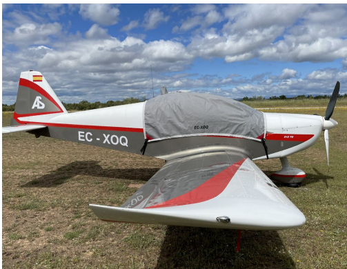
Direct Fly Alto Travel Cover, Light Weight Canopy Cover