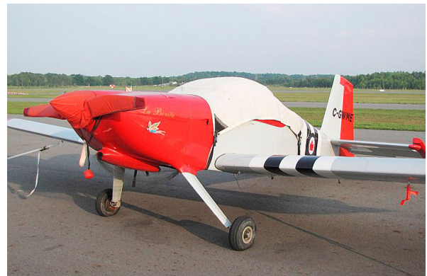
Van's RV-6 2-Blade Prop Cover