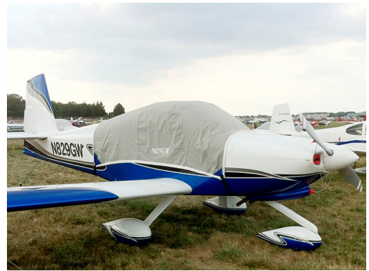
Van's RV-10 Canopy Cover & Engine Inlet Plugs