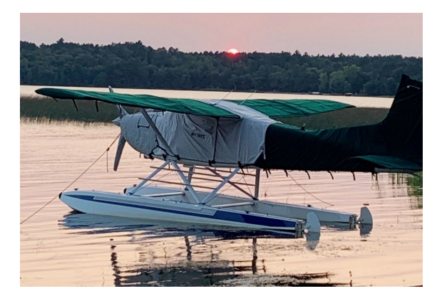
Cessna A185F Complete Cover Set