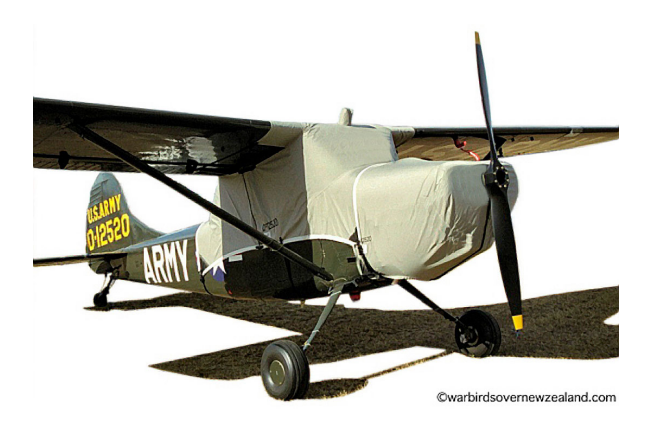
Cessna L-19 Bird Dog Canopy Cover