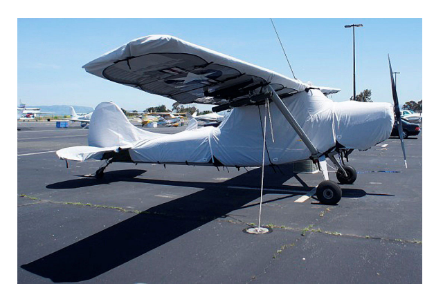
Cessna L-19 Extended Over-the-top Canopy, Engine, Empennage & Wing Covers