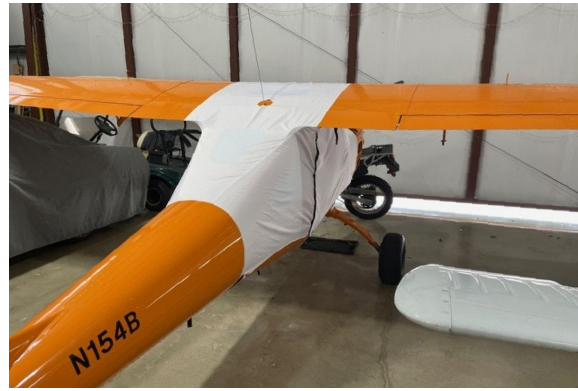
Aeromarine Merlin Over-Top Canopy Cover, test fit cover