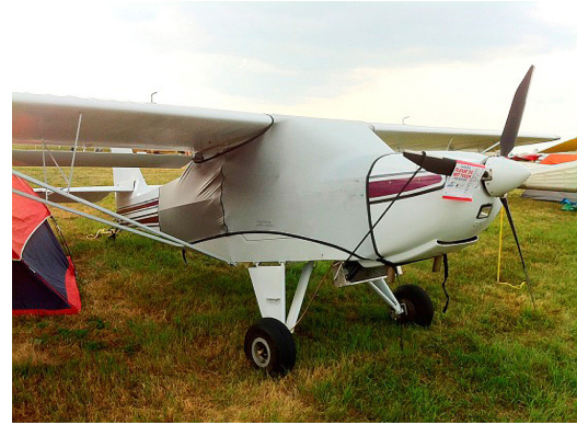
Kitfox Spandex FlyAway Travel Canopy Cover