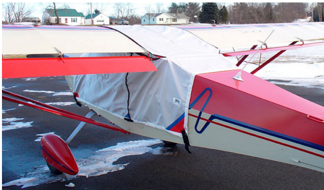
Kitfox IV Over-the-top Canopy Cover

This cover type is made from Silver Acrylic Sunbrella canvas and is 100% lined with a soft and smooth microfiber. Bruce's Custom Covers developed this material combination especially for aircraft protection. The outer material is medium weight and treated for water resistance, UV resistance and anti-static buildup. The inner lining is a very soft and smooth microfiber to prevent scratching. The material is very reflective, and tests show that the cabin interior temperature can be reduced to near-ambient temperature on the hottest of days. It is water, ice and snow repellent, yet breathable to allow moisture to escape from between the cover and the aircraft surface.