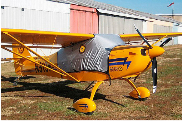
Aerotrek A220 Fitted Hangar Dust Cover

Travel Covers are made with Silver Solution-Dyed Polyester fabric and only lined over the windshield to save weight. The material is lightweight and more compact for easy stowage in the aircraft. The polyester material is water resistant, but only intended for occasional use outside. We also have an ultra lightweight material available for fitted hangar dust covers. For daily outdoor use, the non-travel Sunbrella Cover is the best choice.