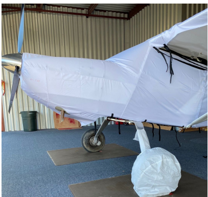
Kitfox Extended Canopy/Engine Cover, test fit cover

This cover type is made from Silver Acrylic Sunbrella canvas and is 100% lined with a soft and smooth microfiber. Bruce's Custom Covers developed this material combination especially for aircraft protection. The outer material is medium weight and treated for water resistance, UV resistance and anti-static buildup. The inner lining is a very soft and smooth microfiber to prevent scratching. The material is very reflective, and tests show that the cabin interior temperature can be reduced to near-ambient temperature on the hottest of days. It is water, ice and snow repellent, yet breathable to allow moisture to escape from between the cover and the aircraft surface.