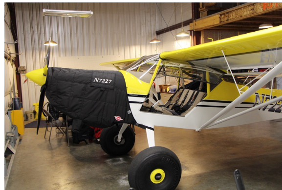
Kitfox Insulated Engine Cover