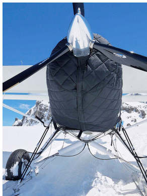
Kitfox Insulated Engine Cover

This cover type is made from Silver Acrylic Sunbrella canvas and is 100% lined with a soft and smooth microfiber. Bruce's Custom Covers developed this material combination especially for aircraft protection. The outer material is medium weight and treated for water resistance, UV resistance and anti-static buildup. The inner lining is a very soft and smooth microfiber to prevent scratching. The material is very reflective, and tests show that the cabin interior temperature can be reduced to near-ambient temperature on the hottest of days. It is water, ice and snow repellent, yet breathable to allow moisture to escape from between the cover and the aircraft surface.