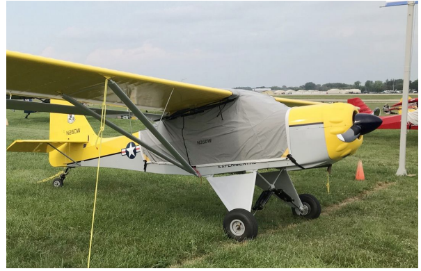
Kitfox Travel Canopy Cover