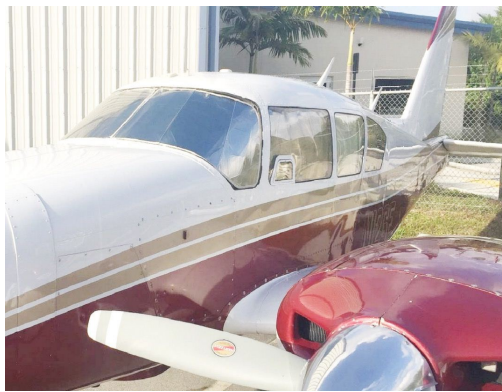
Piper Aztec HeatShield Set