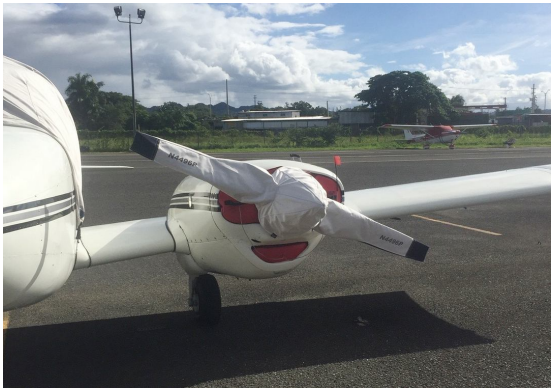
Piper Apache Engine Plugs, Prop Covers