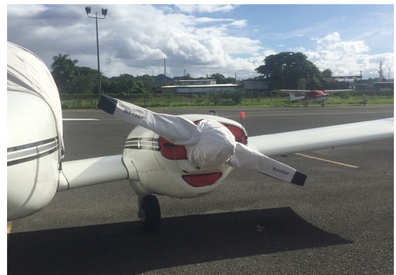
Piper Apache Engine Plugs, Prop Covers