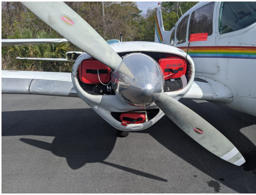
Piper PA-23 Apache Engine Inlet Plugs (fit needs improvement)