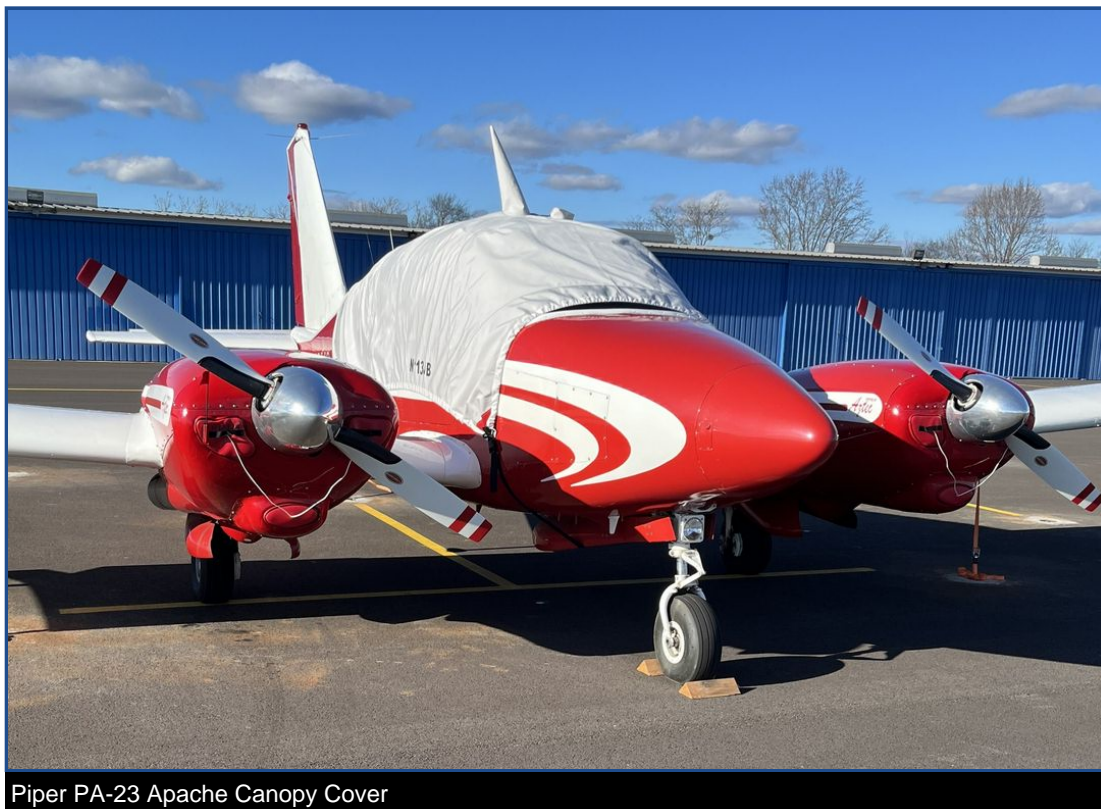
Piper PA-23 Apache Canopy Cover