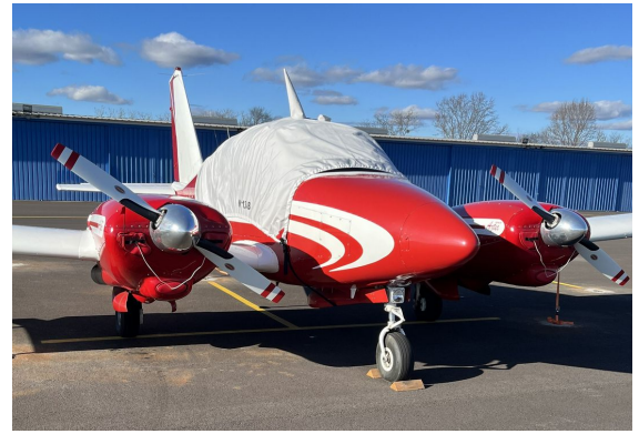
Piper PA-23 Apache Canopy Cover