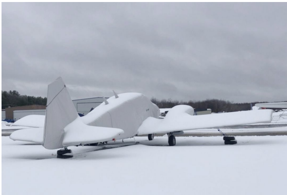
Piper Apache (Geronimo) Full Cover Set

WINTER USE MATERIAL - Made with Solution-Dyed Polyester fabric, this option is intended for seasonal use to aid in deicing, rain mitigation, or for occasional travel. The material is lighter and more compact, but more susceptible to UV damage and may have a shorter useful life if used continuously outside than the all-year use material.