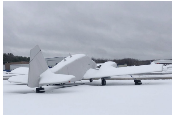
Piper Apache (Geronimo) Full Cover Set