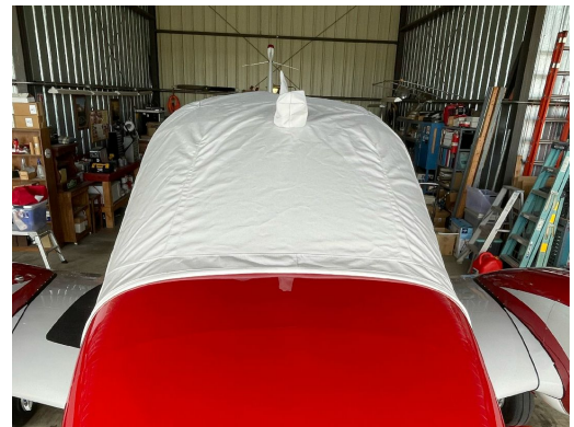
Piper Apache Canopy Cover