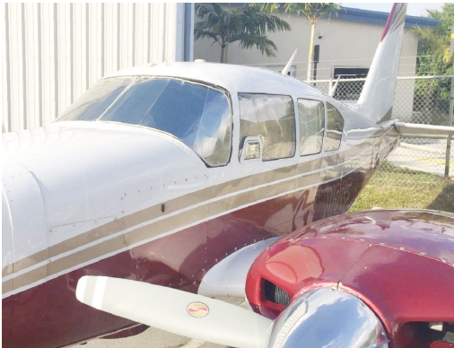
Piper Aztec HeatShield Set

Windshield Heatshields are interior sunshades for an aircraft's front windshield. The product is a unique composite of closed-cell foam with a silver mylar finish. The semi-rigid design is stiff enough to stand along the inside of the windshield using sun visors or window framing. It folds up flat and easily stores in the included storage sleeve. Some designs may require velcro and suction cups or split right and left sides. A Heatshield is an excellent short-term remedy for cockpit overheating. An external fabric cover is far more effective and practical for long-term protection.