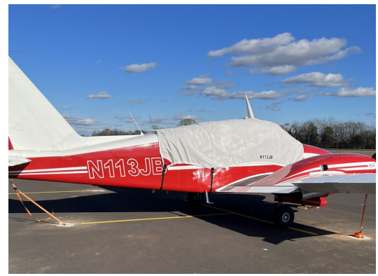
Piper PA-23 Apache Canopy Cover