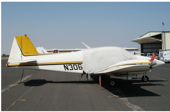
Piper Apache Geronimo Extended Canopy Cover