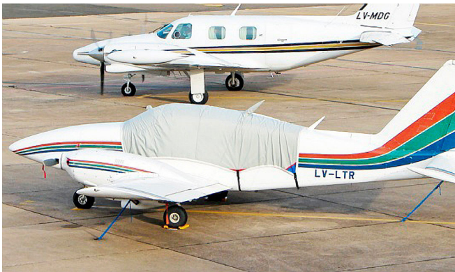
Aztec Canopy Cover

This cover type is made from Silver Acrylic Sunbrella canvas and is 100% lined with a soft and smooth microfiber. Bruce's Custom Covers developed this material combination especially for aircraft protection. The outer material is medium weight and treated for water resistance, UV resistance and anti-static buildup. The inner lining is a very soft and smooth microfiber to prevent scratching. The material is very reflective, and tests show that the cabin interior temperature can be reduced to near-ambient temperature on the hottest of days. It is water, ice and snow repellent, yet breathable to allow moisture to escape from between the cover and the aircraft surface.