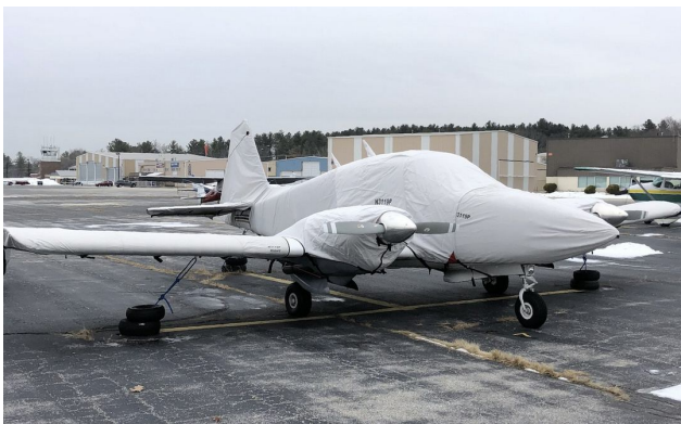
Piper PA-23 Apache Geronimo Extended Canopy Cover

This cover type is made from Silver Acrylic Sunbrella canvas and is 100% lined with a soft and smooth microfiber. Bruce's Custom Covers developed this material combination especially for aircraft protection. The outer material is medium weight and treated for water resistance, UV resistance and anti-static buildup. The inner lining is a very soft and smooth microfiber to prevent scratching. The material is very reflective, and tests show that the cabin interior temperature can be reduced to near-ambient temperature on the hottest of days. It is water, ice and snow repellent, yet breathable to allow moisture to escape from between the cover and the aircraft surface.