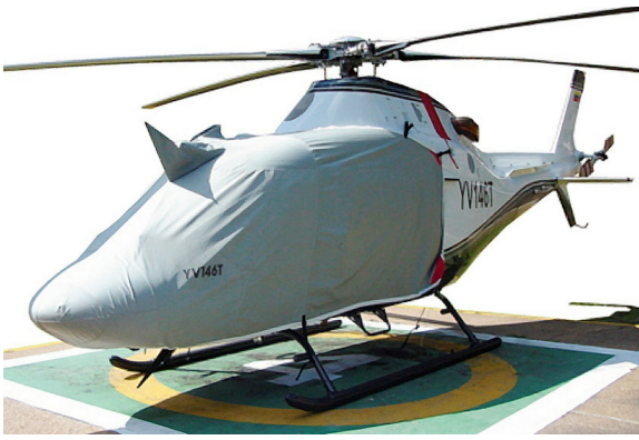
Koala Bubble Cover (with Wire Strike)