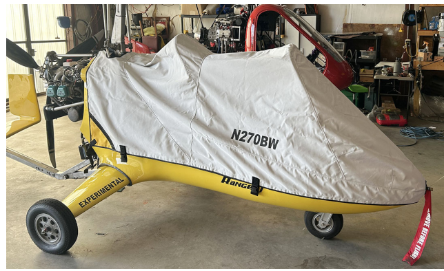
American Ranger AR-1 Gyrocopter Canopy/Nose Cover