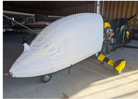
American Ranger AR-1 Gyrocopter Canopy/Nose Cover, enclosed cockpit