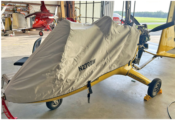
American Ranger AR-1 Gyrocopter Canopy/Nose Cover