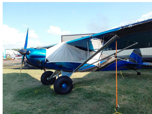
Cub Crafters Carbon Cub Canopy Cover