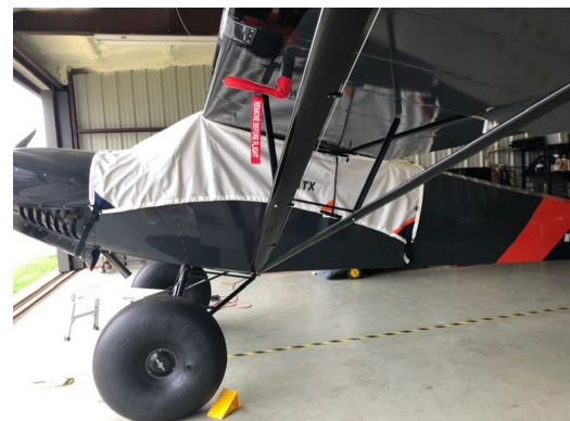
Cub Crafters Carbon Cub SS Engine Inlet Plugs & Pitot Cover CubCrafters CCK-2000 Over The Top Canopy Cover, Pitot Cover