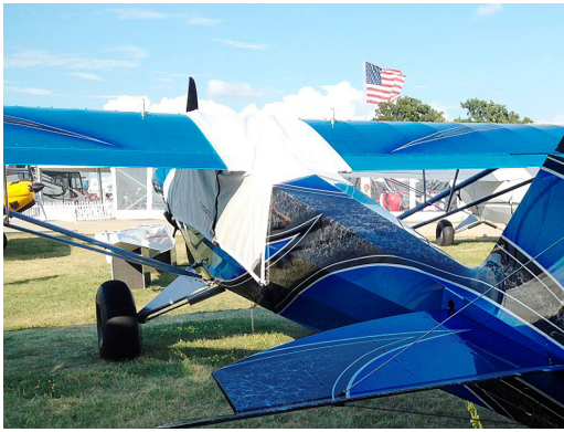
Cub Crafters Carbon Cub Canopy Cover