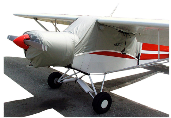
Piper PA-18 Super Cub Canopy & Engine Covers