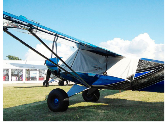
Cub Crafters Carbon Cub Canopy Cover