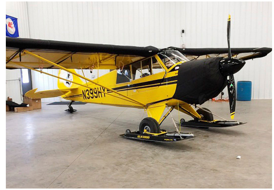
Aviat Husky Insulated Engine Cover, Wing Covers