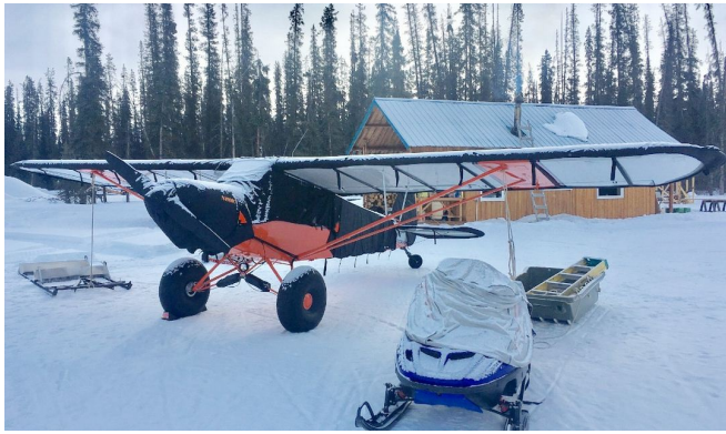
Piper PA-18 Super Cub Canopy Cover (Over-The-Top Style)