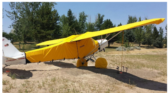
Piper PA-18 Super Cub Extended Canopy Cover, Wing & Tire Covers