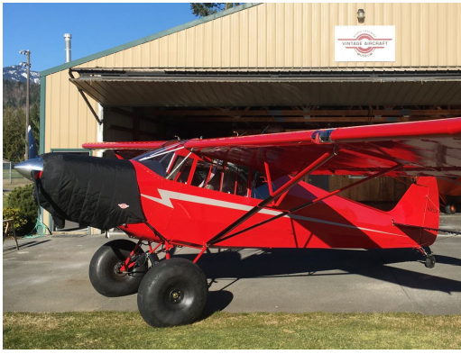
Piper PA-12 Insulated Engine Cover