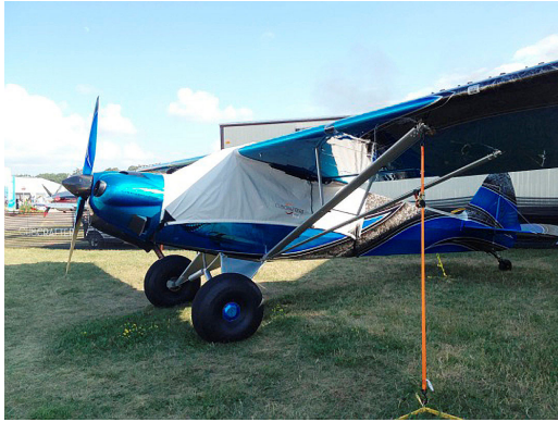
Cub Crafters Carbon Cub Canopy Cover

Travel Covers are made with Silver Solution-Dyed Polyester fabric and only lined over the windshield to save weight. The material is lightweight and more compact for easy stowage in the aircraft. The polyester material is water resistant, but only intended for occasional use outside. We also have an ultra lightweight material available for fitted hangar dust covers. For daily outdoor use, the non-travel Sunbrella Cover is the best choice.