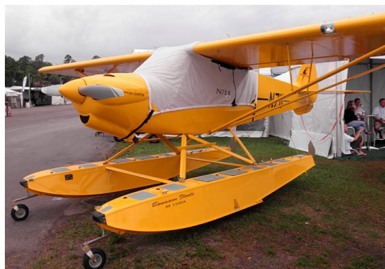
Cub Crafters Carbon Cub Canopy Cover

Travel Covers are made with Silver Solution-Dyed Polyester fabric and only lined over the windshield to save weight. The material is lightweight and more compact for easy stowage in the aircraft. The polyester material is water resistant, but only intended for occasional use outside. We also have an ultra lightweight material available for fitted hangar dust covers. For daily outdoor use, the non-travel Sunbrella Cover is the best choice.