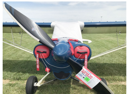
Cub Crafters EX2 Canopy Cover, Engine Plugs