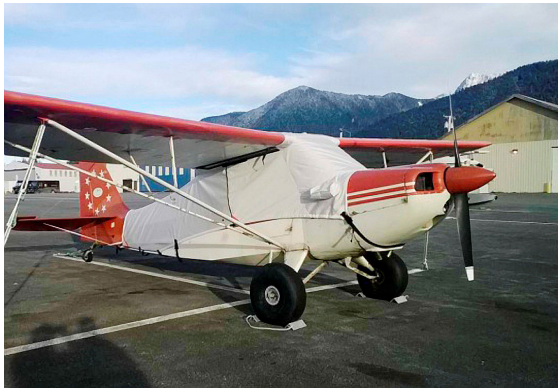
Bellanca Citabria Over-Top Canopy Cover, extended to tail