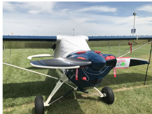
Cub Crafters EX2 Canopy Cover, Engine Plugs