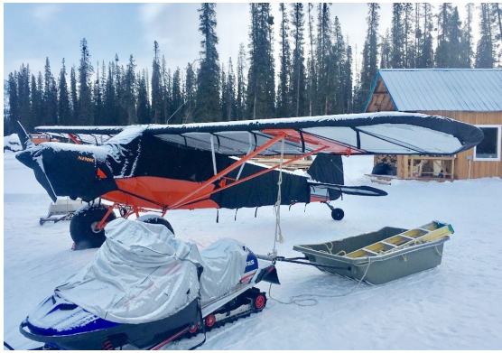
Piper PA-18 Super Cub Canopy Cover (Over-The-Top Style)