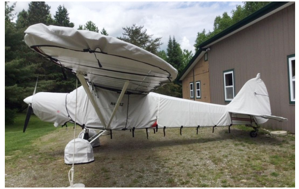
Piper PA-18-150 Super Cub Complete Cover Set