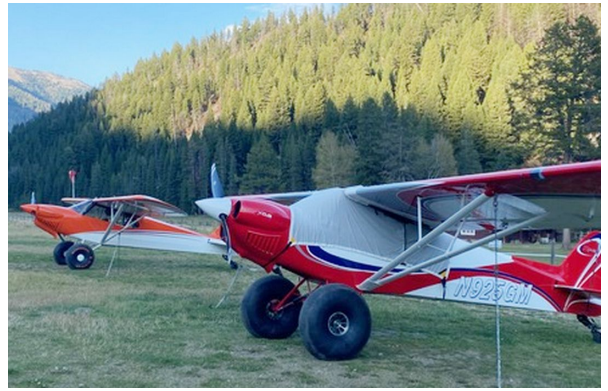
Cub Crafters CCX-2300 Canopy Cover