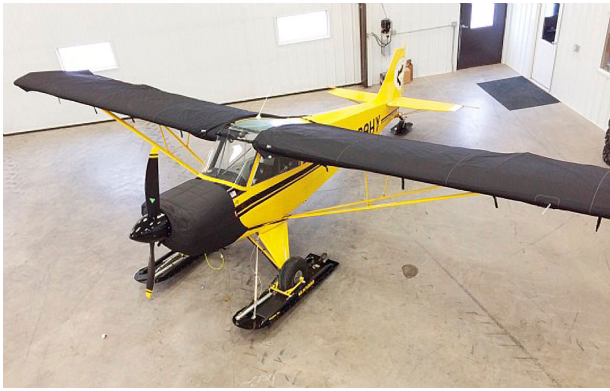
Aviat Husky Insulated Engine Cover, Wing Covers