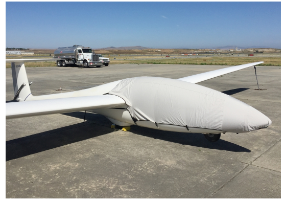
Schleicher ASK-21 Canopy/Nose Cover