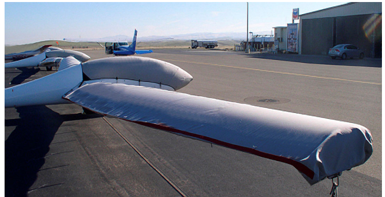
Sailplane Full Cover Set Graphic Indicators (Discus 2B, 3D model)