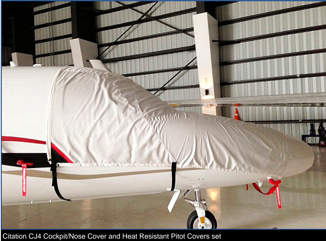
Citation CJ4 Cockpit/Nose Cover and Heat Resistant Pitot Covers set