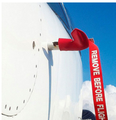
Westwind 1125 Astra Pitot Cover, Heat Resistant Type