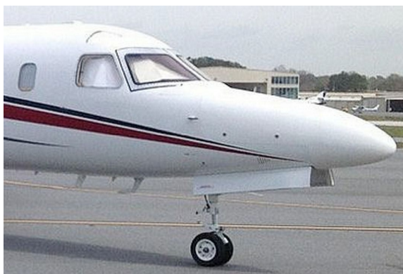
IAI Astra Cockpit Heatshields