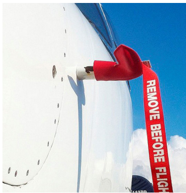
Westwind 1125 Astra Pitot Cover, Heat Resistant Type