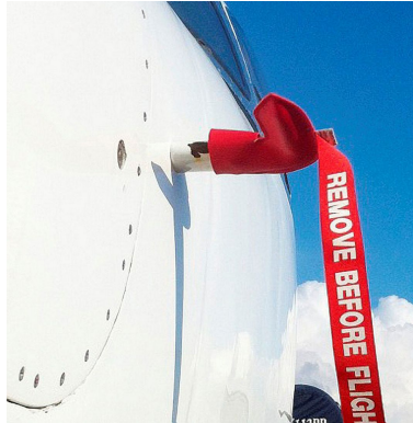
Westwind 1125 Astra Pitot Cover, Heat Resistant Type

The Engine Inlet Plugs are custom fit for your Israel Aircraft Industries Astra (C-38) intakes, made with heavy-duty vinyl material, and stuffed with a single block of sculpted urethane foam. Each plug has a zipper that allows the foam to be removed and dried if necessary. Engine plugs have 'remove before flight' streamers sewn onto the face of the plugs. Most plugs are imprinted with the aircraft registration number in black for an extra charge. Storage bag NOT included. Engine plugs may be inserted after flight when the engine is still warm. Engine Inlet Plugs are commonly referred to as Cowl Plugs, Intake Plugs, Cowl Blocks, Engine Blocks, and Engine Bungs.