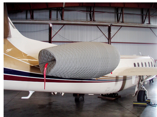
IAI Westwind 1124 Insulated Engine Nacelle Cover