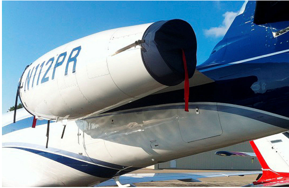
Westwind 1125 Astra Engine Intake/Exhaust Covers Set

The Israel Aircraft Industries Astra (C-38) Bikini Style Engine Covers are a single-piece design using a soft and smooth stretchy fabric. The cover stretches tightly over both the intake and exhaust, installing quickly and easily. These covers are designed to be used as hangar dust covers and have a useful life of approximately one year.