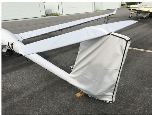
Schleicher ASW-27b Empennage & Wing Covers