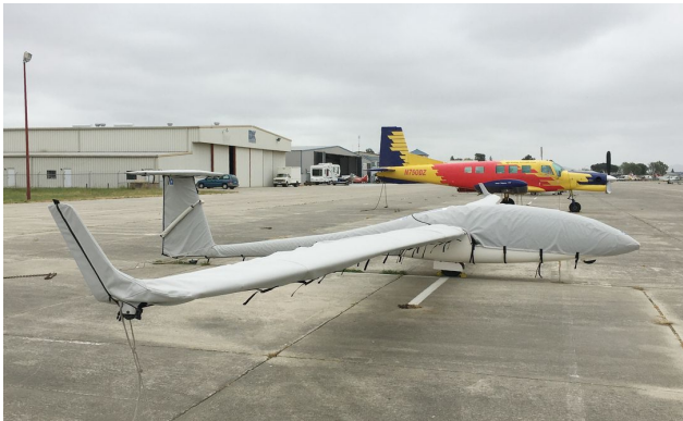
DG-505 Canopy/Nose, Wing, Empennage & Horiz. Stab. Covers DG-505 Canopy/Nose, Wing, Empennage & Horiz. Stab. Covers