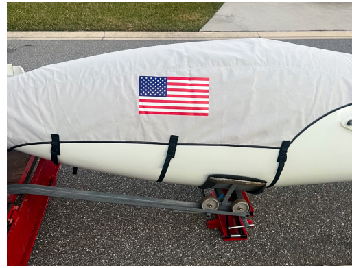
Schleicher ASW-20 Canopy/Nose Cover, ASW-20/20C