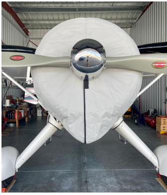
Stinson Reliant V-77, SR, AT-19 Insulated Engine Cover