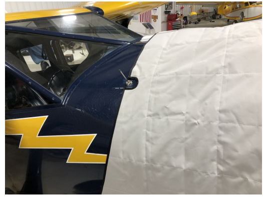
Stinson Reliant SR-10 Insulated Engine Cover