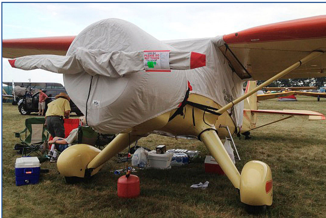
Stinson Reliant Over-the-top Canopy, Engine, and Propeller Cover