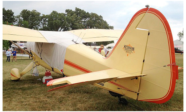
Stinson Reliant Over-the-top Canopy, Engine, and Propeller Cover