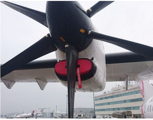
ATR-42/72 Engine Inlet Plugs