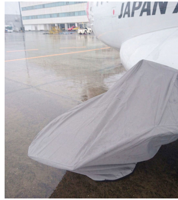
ATR-42/72 Main Gear Landing Gear/Tire Covers