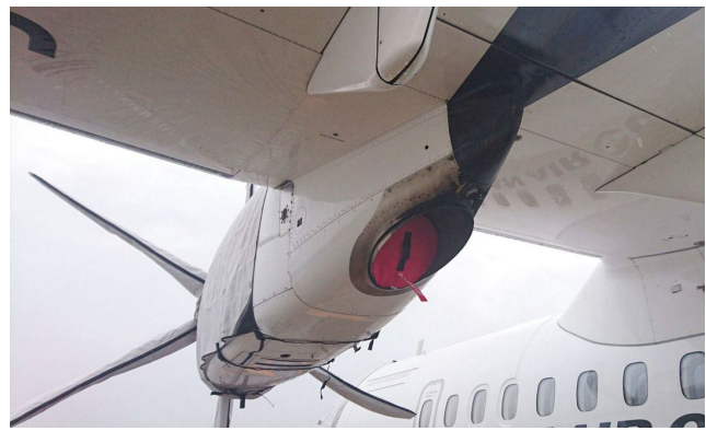
ATR-42/72 Exhaust Plugs