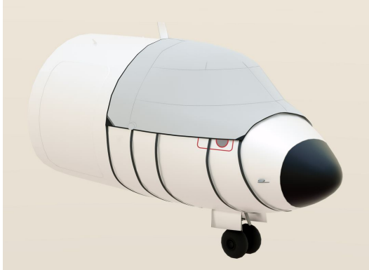
Aerospatiale ATR-42/72 Cockpit Cover, 3D model

This cover type is made from Silver Acrylic Sunbrella canvas and is 100% lined with a soft and smooth microfiber. Bruce's Custom Covers developed this material combination especially for aircraft protection. The outer material is medium weight and treated for water resistance, UV resistance and anti-static buildup. The inner lining is a very soft and smooth microfiber to prevent scratching. The material is very reflective, and tests show that the cabin interior temperature can be reduced to near-ambient temperature on the hottest of days. It is water, ice and snow repellent, yet breathable to allow moisture to escape from between the cover and the aircraft surface.