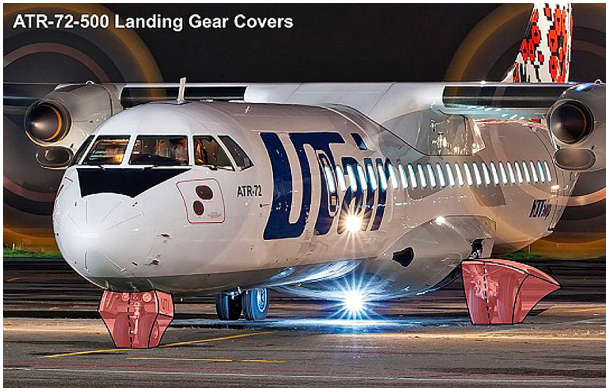
ATR 72 Landing Gear/Tire Covers