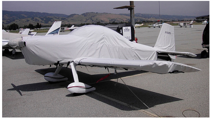
Van's RV-8 Complete Fuselage Cover w/ Detachable Wing Covers & Prop Cover