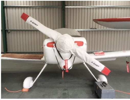
Van's RV-6 Prop/Spinner Cover