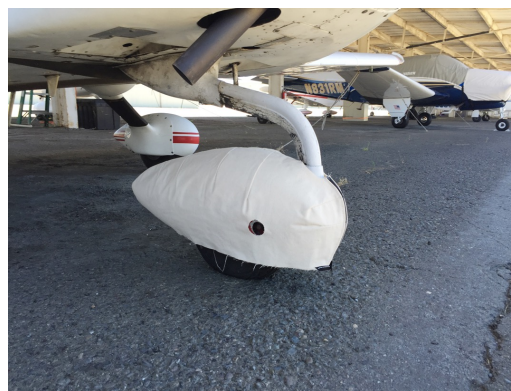
Grumman AA5 Nose Wheelpant Cover, test fit