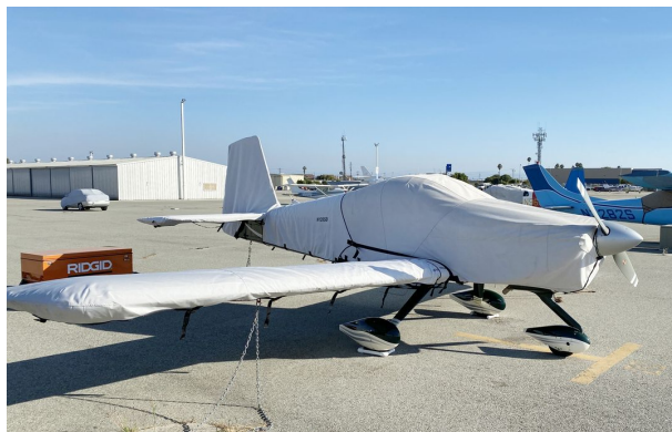
Van's RV-9A Extended Canopy/Engine, Wing & Empennage Covers