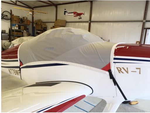
Van's RV-7 Travel Canopy Cover

Travel Covers are made with Silver Solution-Dyed Polyester fabric and only lined over the windshield to save weight. The material is lightweight and more compact for easy stowage in the aircraft. The polyester material is water resistant, but only intended for occasional use outside. We also have an ultra lightweight material available for fitted hangar dust covers. For daily outdoor use, the non-travel Sunbrella Cover is the best choice.