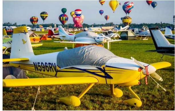
Vans's RV-9 Travel Weight Canopy Cover at Sun 'n Fun