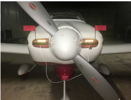
Van's Aircraft RV-7A Engine Inlet Plugs

Engine Inlet Plugs are custom fit for your Aura Aero Integral R intakes, made with heavy-duty vinyl material, and stuffed with a single block of sculpted urethane foam. Each plug has a zipper that allows the foam to be removed and dried if necessary. Engine plugs have warning flags that are visible from the cockpit or 'remove before flight' streamers sewn onto the face of the plugs. Most plugs are imprinted with the aircraft registration number in black for an extra charge. Storage bag NOT included. Engine plugs may be inserted after flight when the engine is still warm. Engine Inlet Plugs are commonly referred to as Cowl Plugs, Intake Plugs, Cowl Blocks, Engine Blocks, and Engine Bungs.