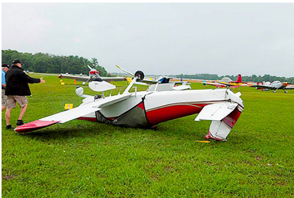
Van's RV-6 Light Weight Travel Cover

This cover type is made from Silver Acrylic Sunbrella canvas and is 100% lined with a soft and smooth microfiber. Bruce's Custom Covers developed this material combination especially for aircraft protection. The outer material is medium weight and treated for water resistance, UV resistance and anti-static buildup. The inner lining is a very soft and smooth microfiber to prevent scratching. The material is very reflective, and tests show that the cabin interior temperature can be reduced to near-ambient temperature on the hottest of days. It is water, ice and snow repellent, yet breathable to allow moisture to escape from between the cover and the aircraft surface.