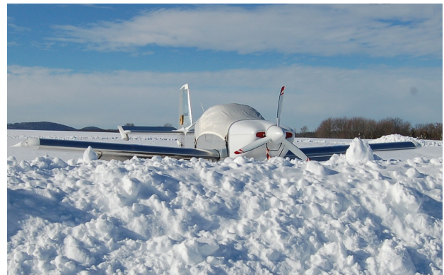
Van's RV-6 Canopy Cover