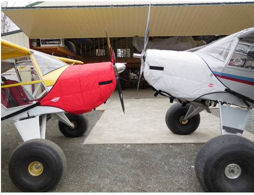
Avid Insulated Engine Covers