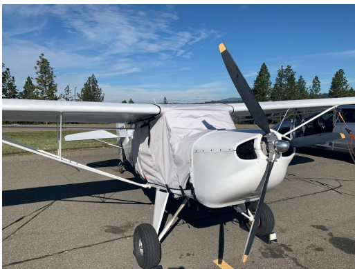
Avid Heavy Hauler MK 4 Over The Top Style Canopy Cover