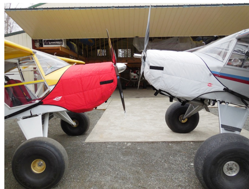
Avid Insulated Engine Covers