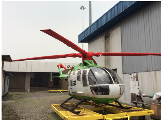
MBB BO-105 Blade, Rotor Head & Tail Rotor Covers

WINTER USE MATERIAL - Made with Solution-Dyed Polyester fabric, this option is intended for seasonal use to aid in deicing, rain mitigation, or for occasional travel. The material is lighter and more compact, but more susceptible to UV damage and may have a shorter useful life if used continuously outside than the all-year use material.