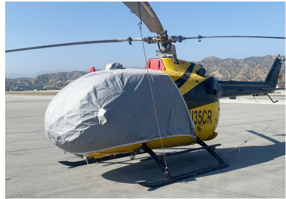
Eurocopter BO-105 Bubble Cover, Standard Model