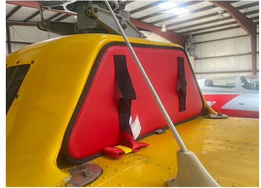
BO 105CB Intake Plug