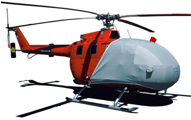
MBB BO-105 Bubble Cover