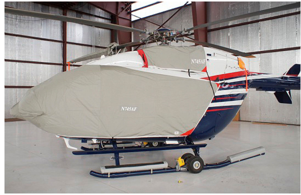
Bubble Cover w/ nose mounted radome, Upper Deck Plugs/Cover