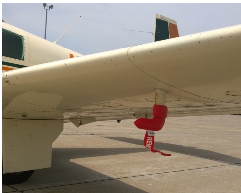
Mooney Pitot Cover