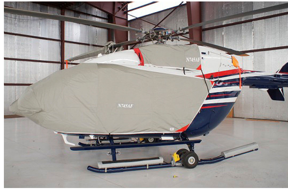
Bubble Cover w/ nose mounted radome, Upper Deck Plugs/Cover

This cover type is made from Silver Acrylic Sunbrella canvas and is 100% lined with a soft and smooth microfiber. Bruce's Custom Covers developed this material combination especially for aircraft protection. The outer material is medium weight and treated for water resistance, UV resistance and anti-static buildup. The inner lining is a very soft and smooth microfiber to prevent scratching. The material is very reflective, and tests show that the cabin interior temperature can be reduced to near-ambient temperature on the hottest of days. It is water, ice and snow repellent, yet breathable to allow moisture to escape from between the cover and the aircraft surface.