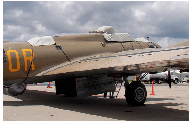
B-17 Canopy/Gun Turret Cover & Hatch Cover