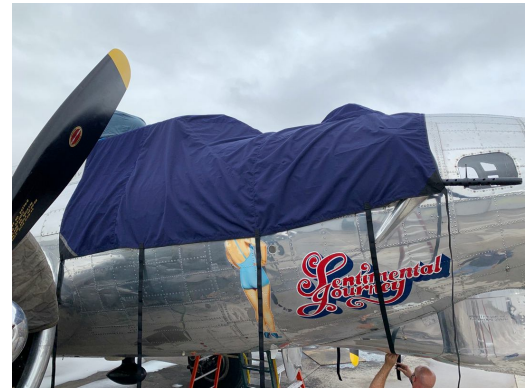
Boeing B-17 Canopy Cover