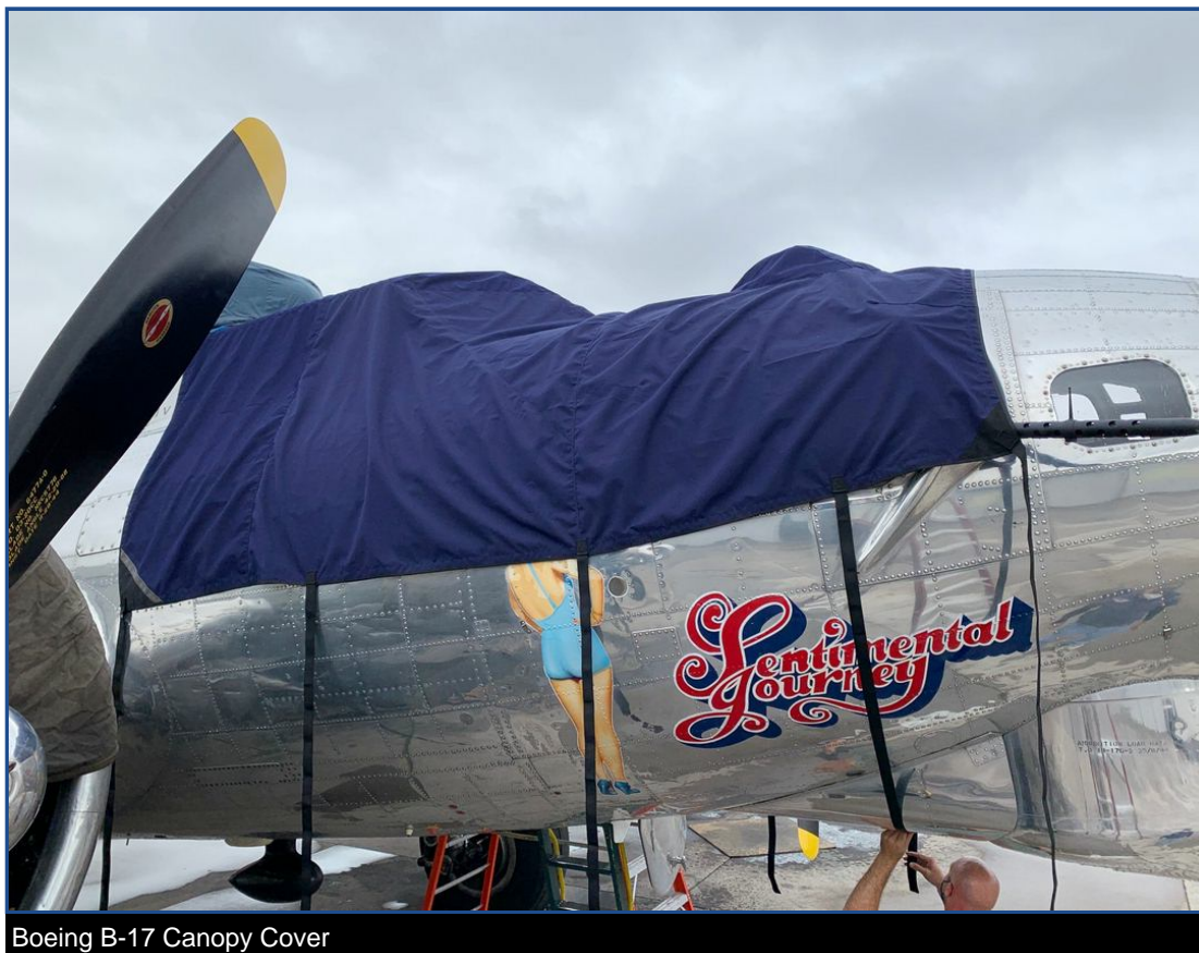
Boeing B-17 Canopy Cover