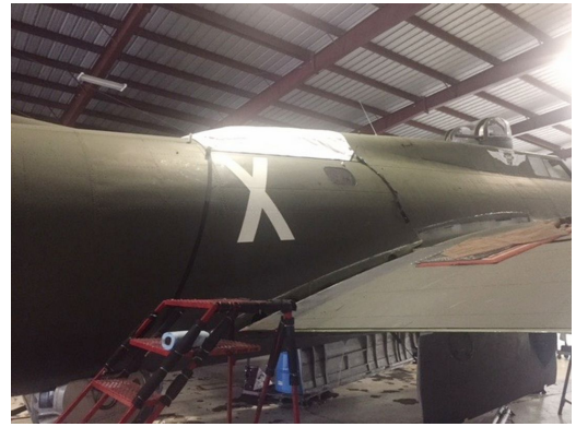
Hatch Cover on a classic B17.