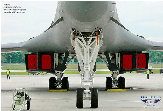
B1-B Bomber Intake Plugs

The Engine Inlet Plugs are custom fit for your Rockwell B-1B Lancer intakes, made with heavy-duty vinyl material, and stuffed with a single block of sculpted urethane foam. Each plug has a zipper that allows the foam to be removed and dried if necessary. Engine plugs have 'remove before flight' streamers sewn onto the face of the plugs. Most plugs are imprinted with the aircraft registration number in black for an extra charge. Storage bag NOT included. Engine plugs may be inserted after flight when the engine is still warm. Engine Inlet Plugs are commonly referred to as Cowl Plugs, Intake Plugs, Cowl Blocks, Engine Blocks, and Engine Bungs.