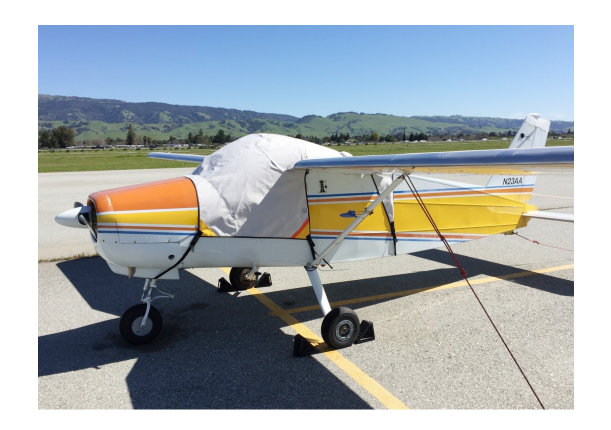
Bolkow Junior 208 Canopy Cover