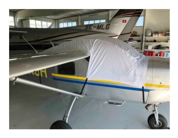
Saab Safari Canopy Cover, test fit cover