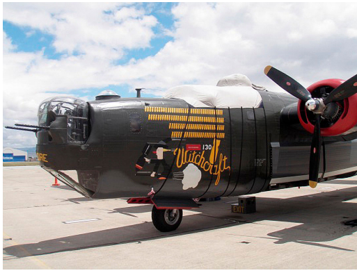
Cockpit/Gun Turret Cover