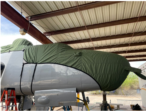
Mitchell B25 Cockpit/Nose Cover, & Turret Cover