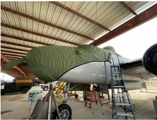
Mitchell B25 Cockpit/Nose Cover, & Turret Cover