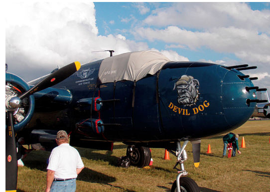
Mitchell B25 Cockpit Cover w/ Custom Imprint (Bellystrap Type)