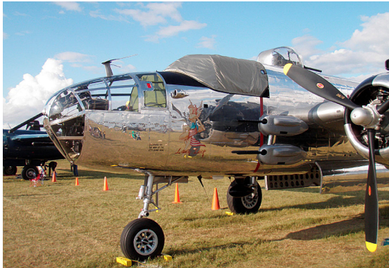
Mitchell B25 Cockpit Cover (Snap-On Type)

This cover type is made from Silver Acrylic Sunbrella canvas and is 100% lined with a soft and smooth microfiber. Bruce's Custom Covers developed this material combination especially for aircraft protection. The outer material is medium weight and treated for water resistance, UV resistance and anti-static buildup. The inner lining is a very soft and smooth microfiber to prevent scratching. The material is very reflective, and tests show that the cabin interior temperature can be reduced to near-ambient temperature on the hottest of days. It is water, ice and snow repellent, yet breathable to allow moisture to escape from between the cover and the aircraft surface.