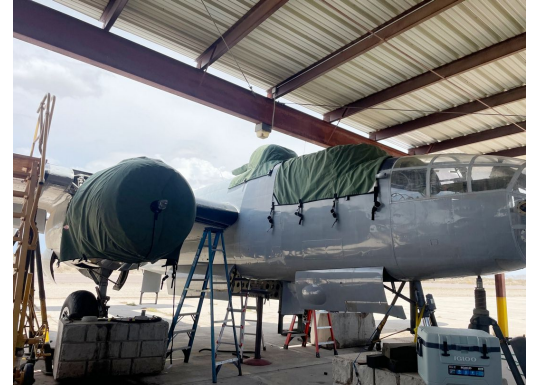
Mitchell B25 Cockpit, Turret & Engine Covers