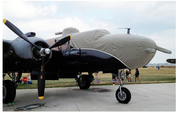
B25 Cockpit/Nose and Gun Turret Covers