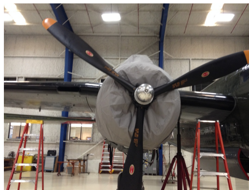
B26 Engine Cover