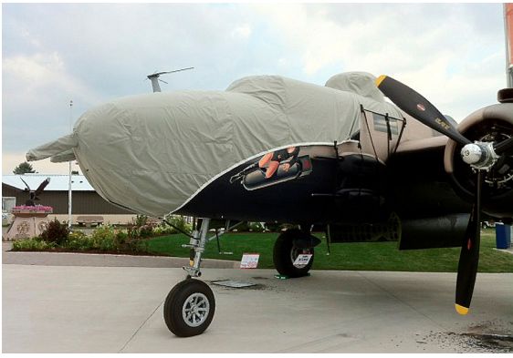
B25 Cockpit/Nose and Gun Turret Covers