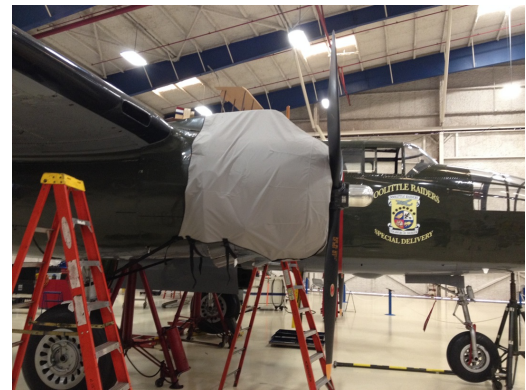
B25 Engine Cover