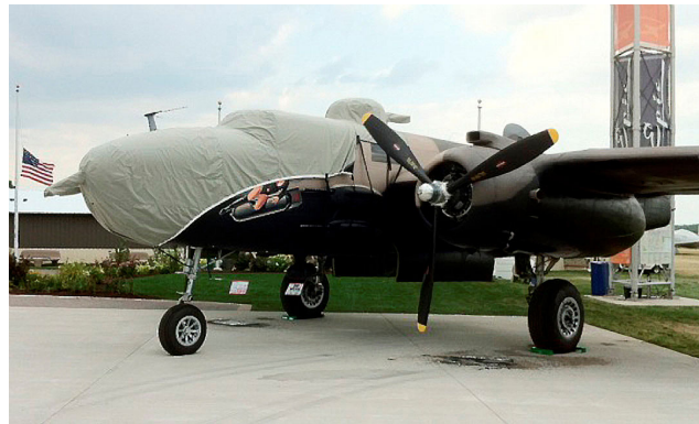
B26 Cockpit/Nose and Gun Turret Covers