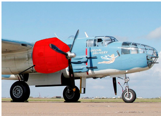
B25 Engine Cover, Illustration

Engine Covers will cinch around or behind the spinner, cover the entire engine cowl area including the engine air cooling and induction air inlets, and fastens together with Velcro beneath the spinner down the front of the cowling. The Engine Cover is attached with a belly strap aft of the firewall, and can Velcro to the Canopy Cover. Engine Covers are normally made from Solution-Dyed Polyester or Acrylic Sunbrella . An Insulated version of the engine cover can be made with a thicker, quilted, and water-repellent material. The Insulated Engine Cover works well in cold climates to help with engine preheating.