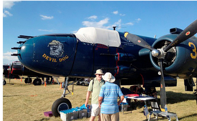
Mitchell B25 Cockpit Cover w/ Custom Imprint (Bellystrap Type)