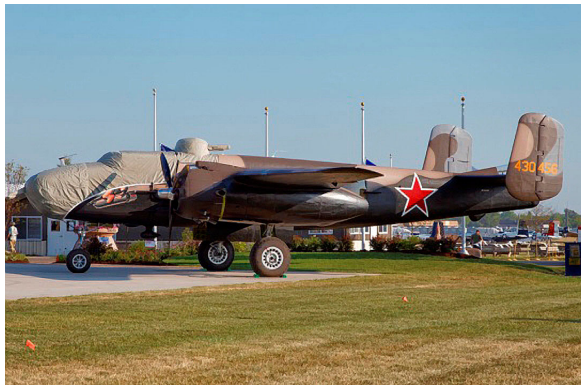
B26 Cockpit/Nose and Gun Turret Covers

This cover type is made from Silver Acrylic Sunbrella canvas and is 100% lined with a soft and smooth microfiber. Bruce's Custom Covers developed this material combination especially for aircraft protection. The outer material is medium weight and treated for water resistance, UV resistance and anti-static buildup. The inner lining is a very soft and smooth microfiber to prevent scratching. The material is very reflective, and tests show that the cabin interior temperature can be reduced to near-ambient temperature on the hottest of days. It is water, ice and snow repellent, yet breathable to allow moisture to escape from between the cover and the aircraft surface.