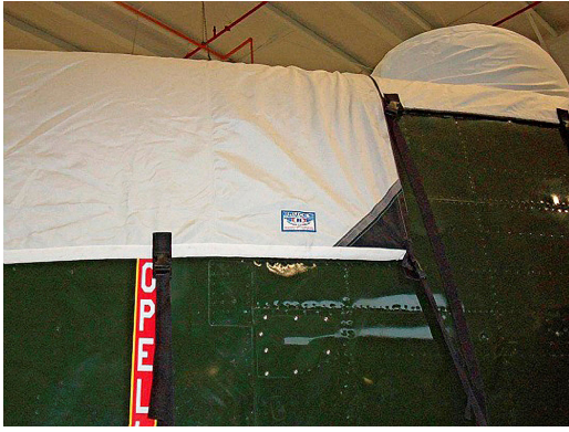
B25 Gun Turret Cover