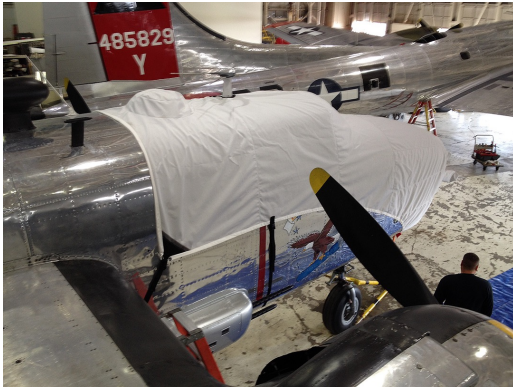
B25 Cockpit/Nose Cover

This cover type is made from Silver Acrylic Sunbrella canvas and is 100% lined with a soft and smooth microfiber. Bruce's Custom Covers developed this material combination especially for aircraft protection. The outer material is medium weight and treated for water resistance, UV resistance and anti-static buildup. The inner lining is a very soft and smooth microfiber to prevent scratching. The material is very reflective, and tests show that the cabin interior temperature can be reduced to near-ambient temperature on the hottest of days. It is water, ice and snow repellent, yet breathable to allow moisture to escape from between the cover and the aircraft surface.