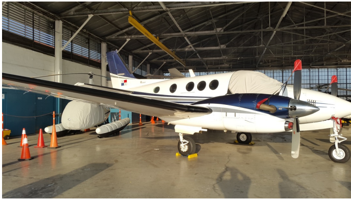
Raytheon Beech King Air Cockpit Cover, Prop Tie/Exhaust Covers, Inlet Plugs