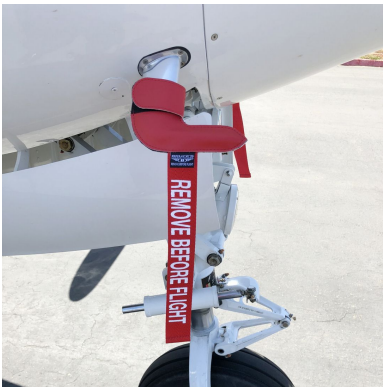
Beech King Air Pitot Covers