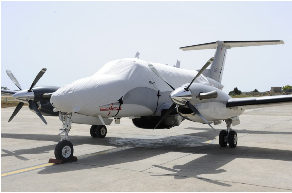
King Air 200 Canopy/Nose Cover