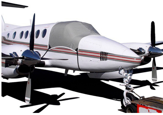
King Air 200/300 Snap-On Windshield Cover