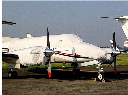
King Air 350 Canopy/Nose Cover, Engine Covers