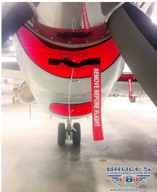
Engine and Oil Cooler Inlet Plugs

Engine Inlet Plugs are custom fit for your Beech King Air 300 intakes, made with heavy-duty vinyl material, and stuffed with a single block of sculpted urethane foam. Each plug has a zipper that allows the foam to be removed and dried if necessary. Engine plugs have warning flags that are visible from the cockpit or 'remove before flight' streamers sewn onto the face of the plugs. Most plugs are imprinted with the aircraft registration number in black for an extra charge. Storage bag NOT included. Engine plugs may be inserted after flight when the engine is still warm. Engine Inlet Plugs are commonly referred to as Cowl Plugs, Intake Plugs, Cowl Blocks, Engine Blocks, and Engine Bungs.