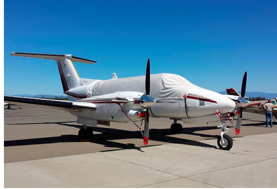
King Air 300 Canopy Cover, Engine Plugs, Prop Tie/Exhaust Covers