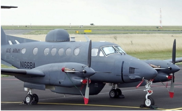
Beech King Air 300 Cockpit HeatShields, Engine Plugs, Prop Ties

plugs have warning flags that are visible from the cockpit or 'remove before flight' streamers sewn onto the face of the plugs. Most plugs are imprinted with the aircraft registration number in black for an extra charge. Storage bag NOT included. Engine plugs may be inserted after flight when the engine is still warm. Engine Inlet Plugs are commonly referred to as Cowl Plugs, Intake Plugs, Cowl Blocks, Engine Blocks, and Engine Bungs.