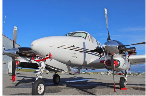
King Air C90A Engine Plugs and Pitot Covers