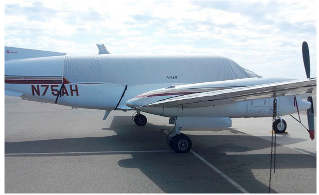
King Air 350 Canopy Cover