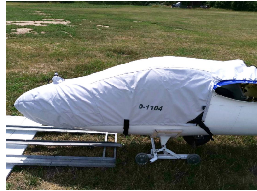
Pilatus B-4 Canopy/Nose Cover