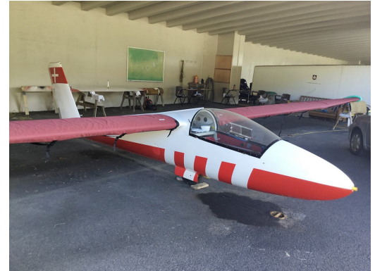
Pilatus B4 Wing Covers