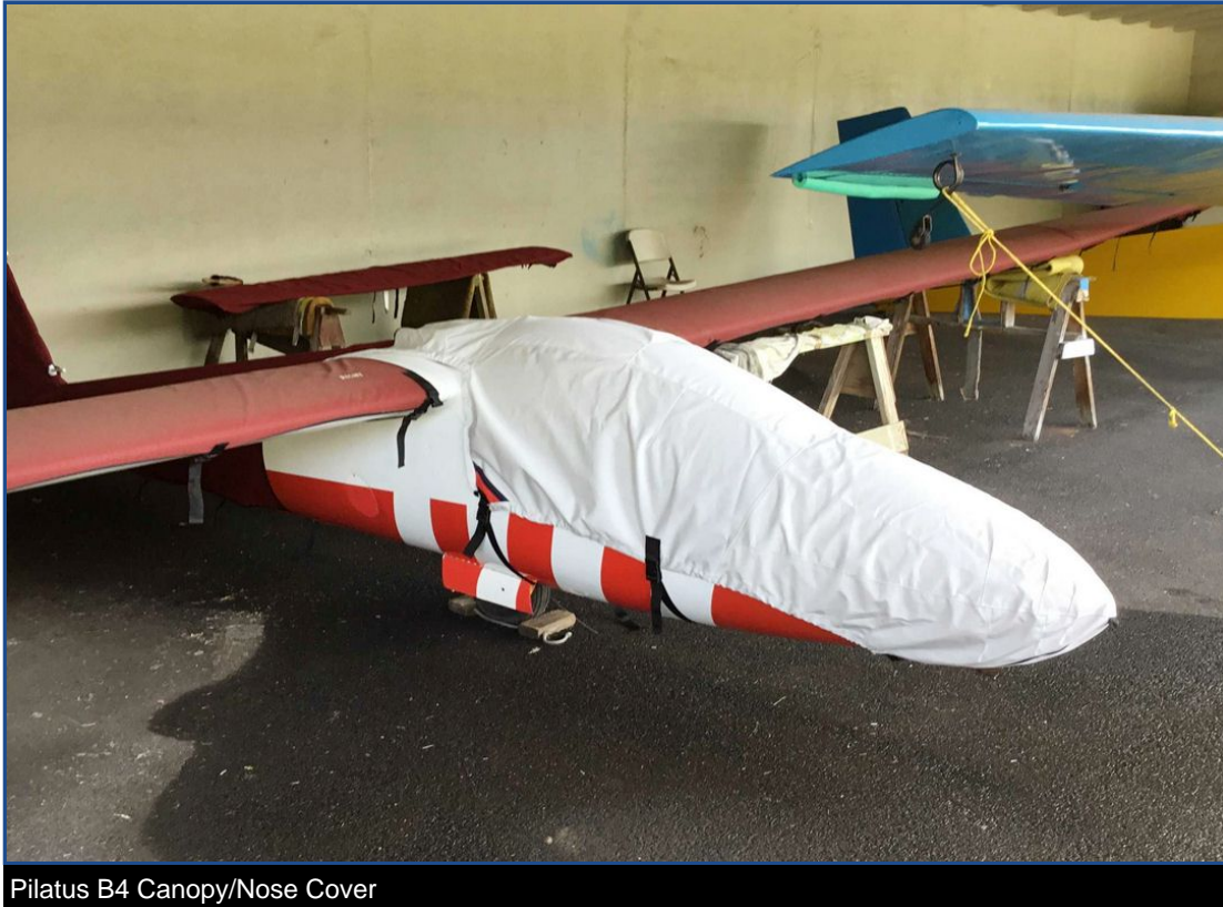
Pilatus B4 Canopy/Nose Cover