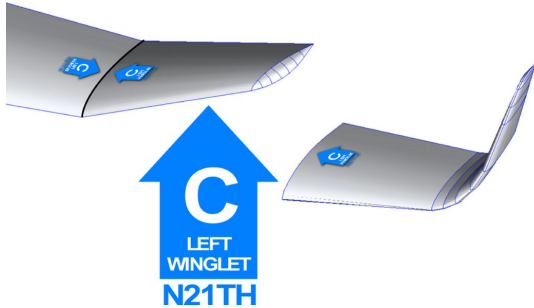
Sailplane Full Cover Set Graphic Indicators (Discus 2B, 3D model)

WINTER USE MATERIAL - Made with Solution-Dyed Polyester fabric, this option is intended for seasonal use to aid in deicing, rain mitigation, or for occasional travel. The material is lighter and more compact, but more susceptible to UV damage and may have a shorter useful life if used continuously outside than the all-year use material.