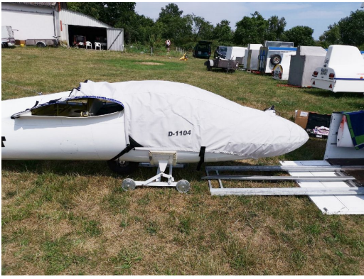
Pilatus B-4 Canopy/Nose Cover