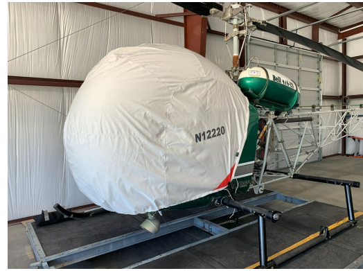
Bell 47 Bubble Cover