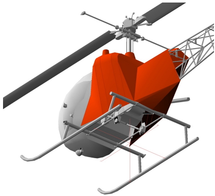
Bell 47 Engine Area Cover, 3D model

WINTER USE MATERIAL - Made with Solution-Dyed Polyester fabric, this option is intended for seasonal use to aid in deicing, rain mitigation, or for occasional travel. The material is lighter and more compact, but more susceptible to UV damage and may have a shorter useful life if used continuously outside than the all-year use material.