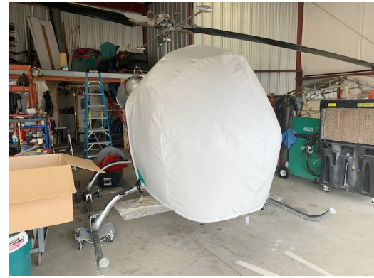
Bell 47 Bubble Cover, Narrow Cabin