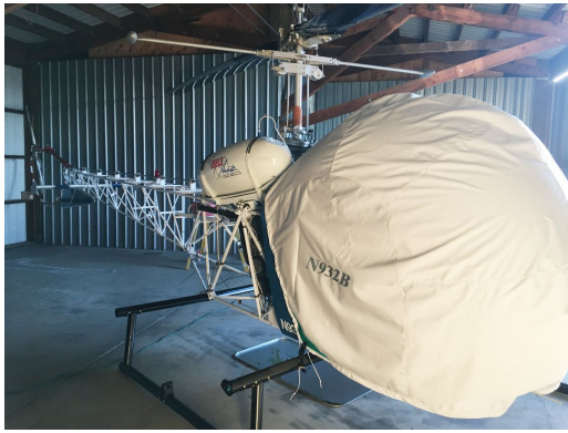
Bell 47 Bubble Cover