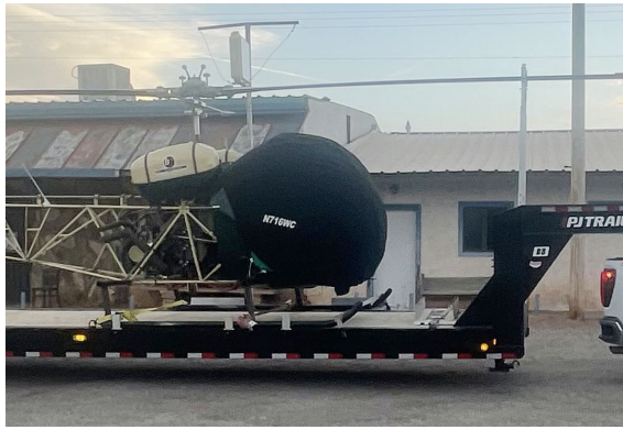
Bell 47 Bubble Cover