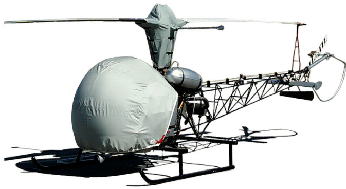
Bubble and Main Rotor Mast Covers