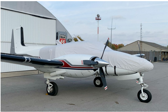
Beech Twin Bonanza Canopy/Nose Cover

This cover type is made from Silver Acrylic Sunbrella canvas and is 100% lined with a soft and smooth microfiber. Bruce's Custom Covers developed this material combination especially for aircraft protection. The outer material is medium weight and treated for water resistance, UV resistance and anti-static buildup. The inner lining is a very soft and smooth microfiber to prevent scratching. The material is very reflective, and tests show that the cabin interior temperature can be reduced to near-ambient temperature on the hottest of days. It is water, ice and snow repellent, yet breathable to allow moisture to escape from between the cover and the aircraft surface.