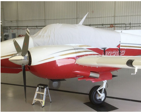
Beech Twin Bonanza D50A Canopy Cover