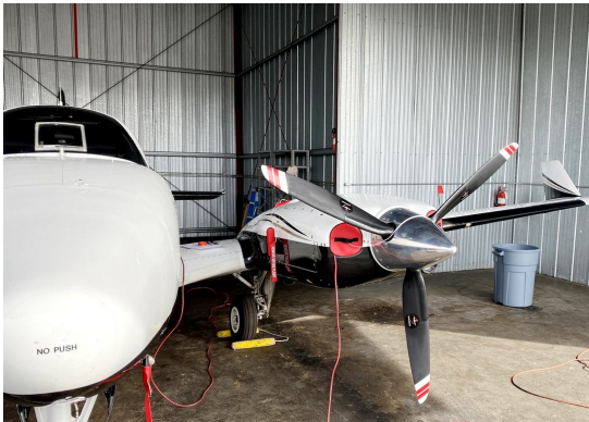
Baron 58 Engine Plugs

Engine Inlet Plugs are custom fit for your Beech Baron 58, G58 intakes, made with heavy-duty vinyl material, and stuffed with a single block of sculpted urethane foam. Each plug has a zipper that allows the foam to be removed and dried if necessary. Engine plugs have warning flags that are visible from the cockpit or 'remove before flight' streamers sewn onto the face of the plugs. Most plugs are imprinted with the aircraft registration number in black for an extra charge. Storage bag NOT included. Engine plugs may be inserted after flight when the engine is still warm. Engine Inlet Plugs are commonly referred to as Cowl Plugs, Intake Plugs, Cowl Blocks, Engine Blocks, and Engine Bungs.