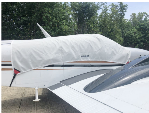
Baron G58 Travel Cover