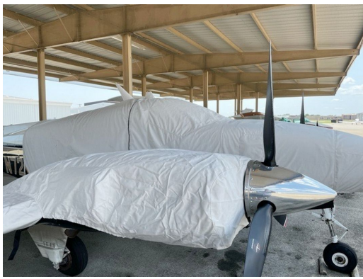
Beech Baron 58P Extended Canopy/Nose Cover, Wing/Engine Covers (test fit)