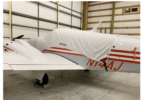
Beech Baron 58 Canopy/Nose Cover