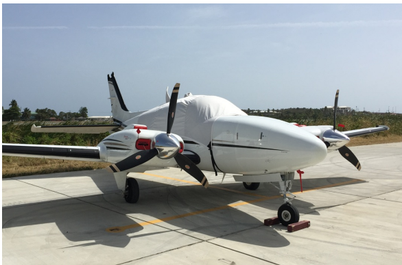
Baron 58 Canopy Cover, Engine Plugs

This cover type is made from Silver Acrylic Sunbrella canvas and is 100% lined with a soft and smooth microfiber. Bruce's Custom Covers developed this material combination especially for aircraft protection. The outer material is medium weight and treated for water resistance, UV resistance and anti-static buildup. The inner lining is a very soft and smooth microfiber to prevent scratching. The material is very reflective, and tests show that the cabin interior temperature can be reduced to near-ambient temperature on the hottest of days. It is water, ice and snow repellent, yet breathable to allow moisture to escape from between the cover and the aircraft surface.