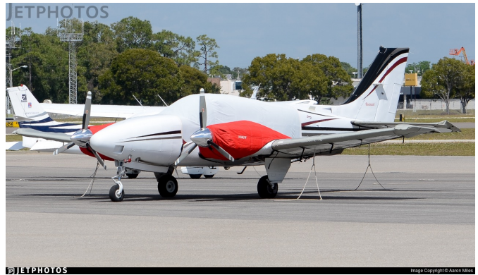
Beech Baron 58, G58 Canopy Cover, Insulated Engine Covers