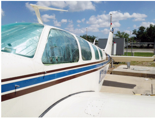
Beech Bonanza Heatshield Set