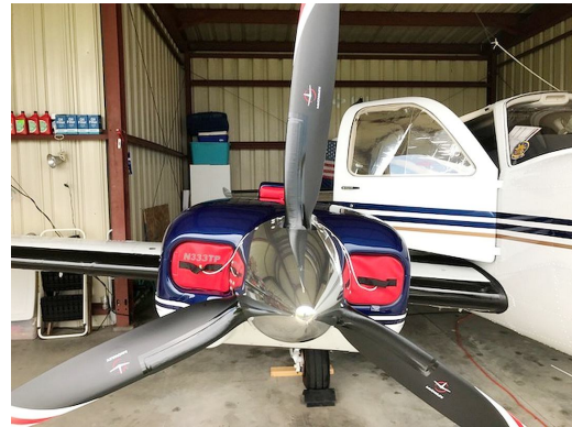
Beech Baron 58 Engine Inlet Plugs & Cowl Top Plugs