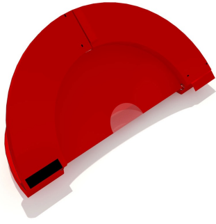
Airbus A330 Intake Plug, framed bi-fold type