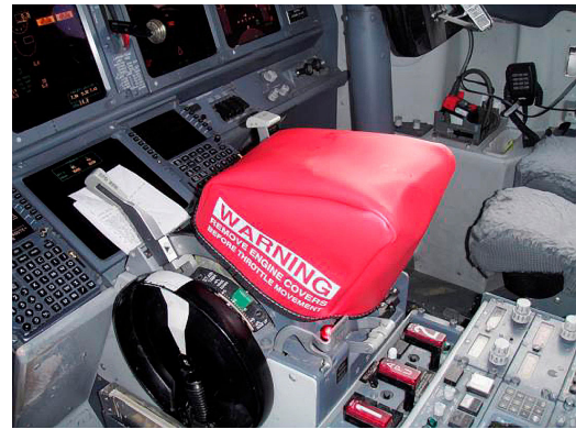
Boeing Throttle Quadrant Cover