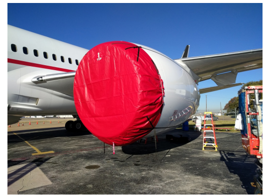
Boeing 787 Intake Cover