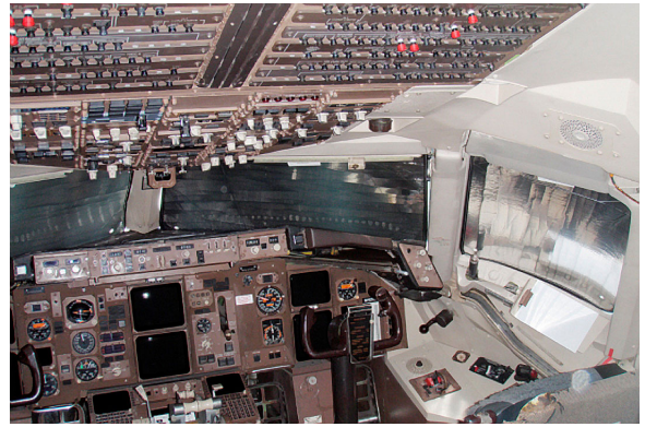
Boeing 757 Cockpit HeatShield set