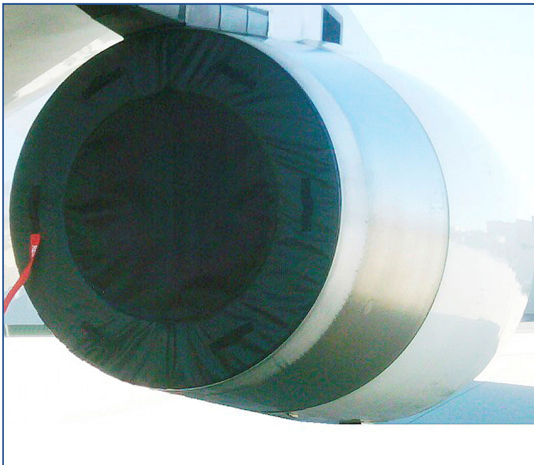
Boeing 757 Exhaust Plugs, RB.211 Engine (Comes in colors)