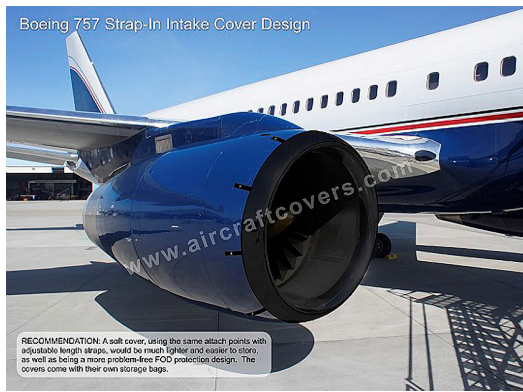
Boeing 757 RB.211 Intake Covers, using existing pit pin locations