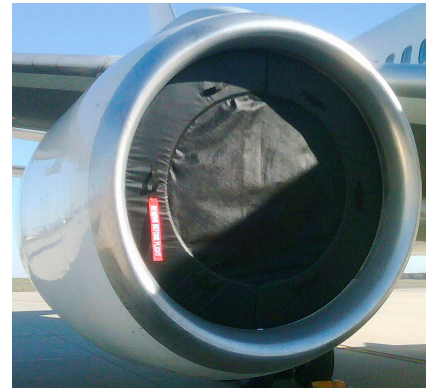
Boeing 757 Intake Plugs, RB.211 Engine (Comes in colors)