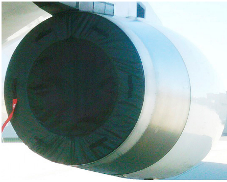
Boeing 757 Exhaust Plugs, RB.211 Engine (Comes in colors)