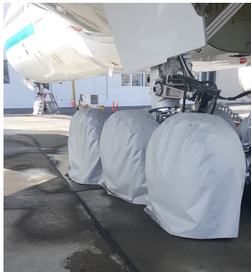
Boeing 777 Main & Nose Gear Tire Covers

ALL-YEAR USE MATERIAL - Made with Silver Acrylic Sunbrella canvas, the all-year use material is the best option for sun protection and cover longevity. This heavier more durable material is intended for all weather conditions, such as rain and snow or lots of sun.