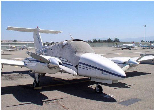
Beech Duchess Canopy Cover