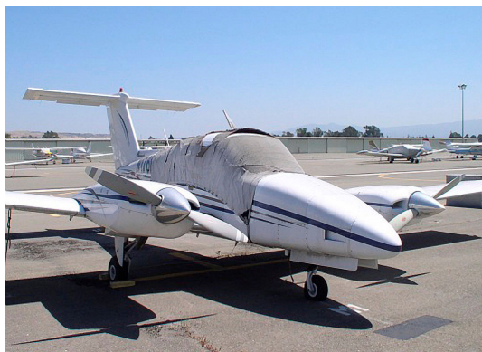
Beech Duchess Canopy Cover