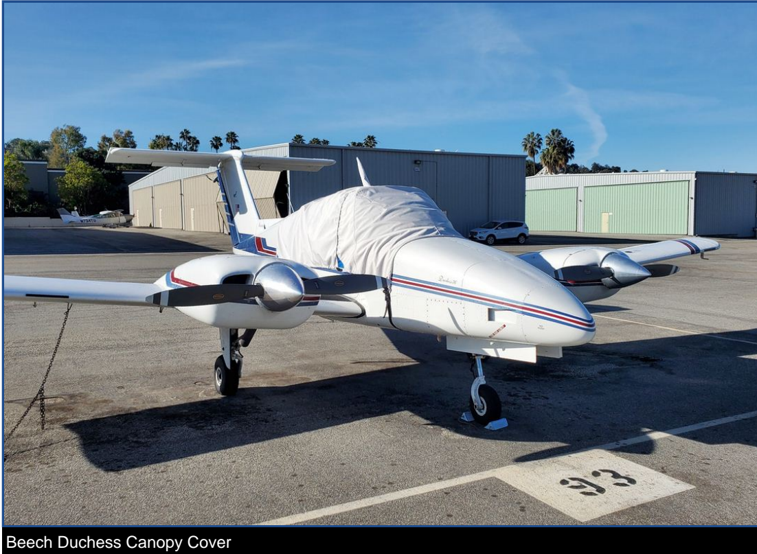
Beech Duchess Canopy Cover