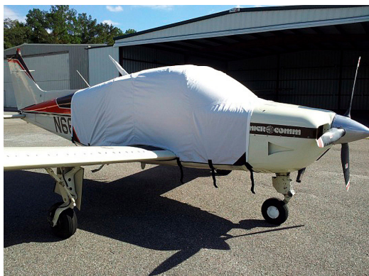
Beech Sport Extended Canopy Cover

This cover type is made from Silver Acrylic Sunbrella canvas and is 100% lined with a soft and smooth microfiber. Bruce's Custom Covers developed this material combination especially for aircraft protection. The outer material is medium weight and treated for water resistance, UV resistance and anti-static buildup. The inner lining is a very soft and smooth microfiber to prevent scratching. The material is very reflective, and tests show that the cabin interior temperature can be reduced to near-ambient temperature on the hottest of days. It is water, ice and snow repellent, yet breathable to allow moisture to escape from between the cover and the aircraft surface.