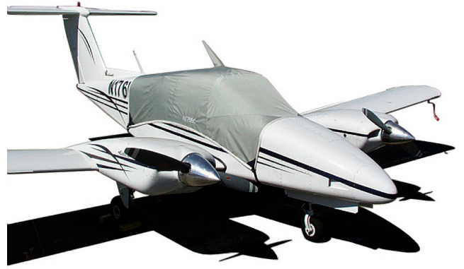
Duchess Standard Canopy Cover