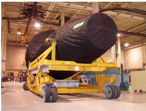
GE CF6 Series Off-Link Engine Shipper Cover, w/ Exhaust Cone, Fully enclosed

FABRIC & THREAD: For strength, durability and ease of use we make these covers of the heaviest nylon ballistic cloth. It is sewn in multiple courses with Tenara thread, and reinforced with heavy vinyl cloth at high-wear points.