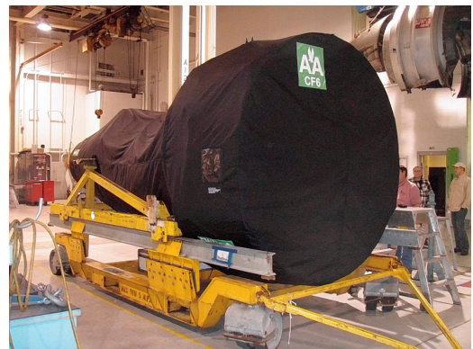
GE CF6 Series Off-Link Engine Shipper Cover, w/ Exhaust Cone, Fully enclosed