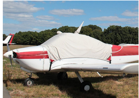
Beech B77 Skipper Canopy Cover