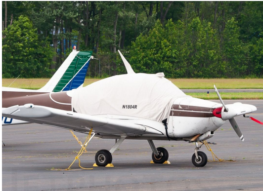
Beech B77 Skipper Canopy Cover

This cover type is made from Silver Acrylic Sunbrella canvas and is 100% lined with a soft and smooth microfiber. Bruce's Custom Covers developed this material combination especially for aircraft protection. The outer material is medium weight and treated for water resistance, UV resistance and anti-static buildup. The inner lining is a very soft and smooth microfiber to prevent scratching. The material is very reflective, and tests show that the cabin interior temperature can be reduced to near-ambient temperature on the hottest of days. It is water, ice and snow repellent, yet breathable to allow moisture to escape from between the cover and the aircraft surface.