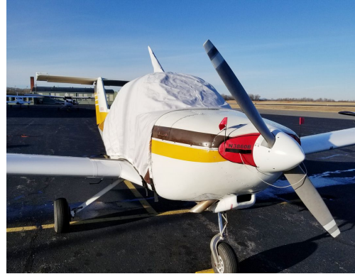
Beech Skipper Extended Canopy Cover and Inlet Plugs