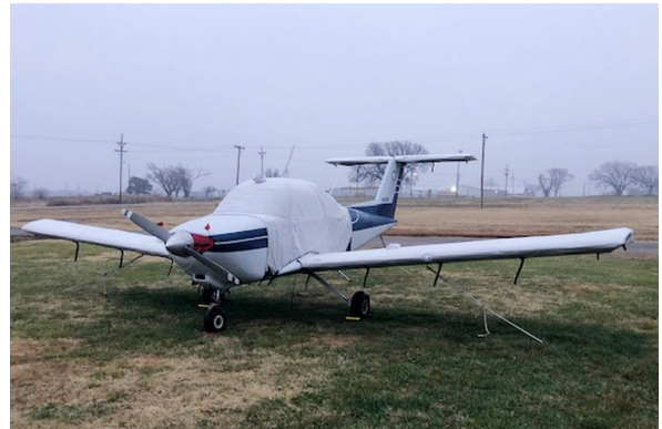
Beech Skipper Extended Canopy Cover, Wing & Horiz. Stab. Covers