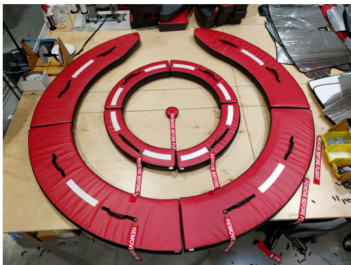
Boeing 747-8 Exhaust Plugs

The Engine Inlet Plugs are custom fit for your Boeing 777 intakes, made with heavy-duty vinyl material, and stuffed with a single block of sculpted urethane foam. Each plug has a zipper that allows the foam to be removed and dried if necessary. Engine plugs have 'remove before flight' streamers sewn onto the face of the plugs. Most plugs are imprinted with the aircraft registration number in black for an extra charge. Storage bag NOT included. Engine plugs may be inserted after flight when the engine is still warm. Engine Inlet Plugs are commonly referred to as Cowl Plugs, Intake Plugs, Cowl Blocks, Engine Blocks, and Engine Bungs.