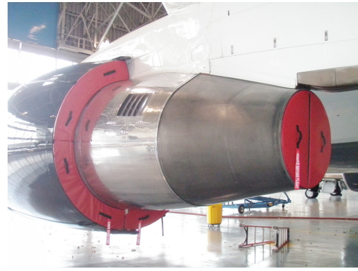
Exhaust Plugs Ship Set, incl. Fan Thrust Reverser and Exhaust Plugs P/N: B767-200