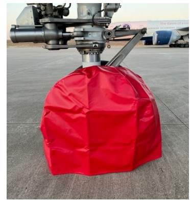
Boeing 777 Nose Gear Tire Covers