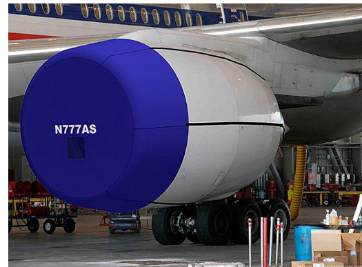
Boeing 777 Intake Cover, GE Engine