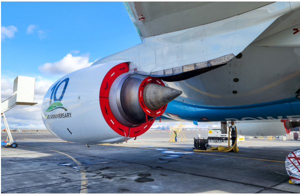
Boeing 777 Bypass Vent & Exhaust Plugs