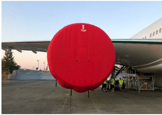
Boeing 777 Intake Covers, GE9X Engine