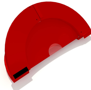
Airbus A330 Intake Plug, framed bi-fold type