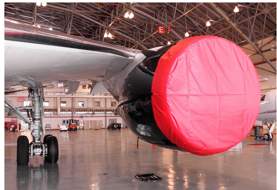
Boeing 767 Intake Covers, P/N: B767-105