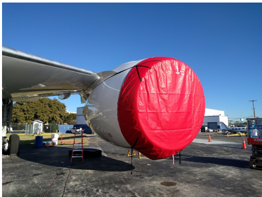
Boeing 787 Intake Cover